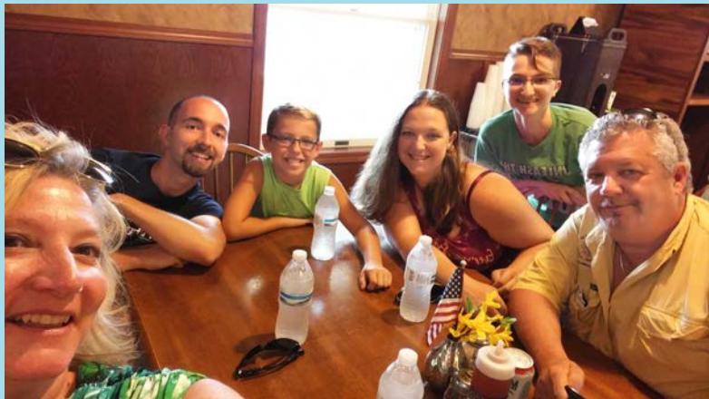
My Family Exploring Ames, IA

My family and I are very close and speak often through Skype and Messenger. I visit them every summer and it is like I have never been away. My mother is extremely supportive of me and can't wait to be a doting Grandmother.