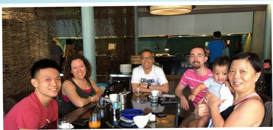
Thailand Trip with Friends and their Adopted Daughter