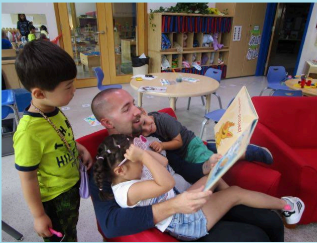
Story time with some of my students