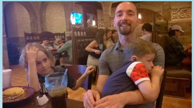
Two of my nephews. They and I love our visits in the summer!

I have been teaching children for almost a decade. My main focus has always been early childhood and this is where my main passion lies. Outside of school, I have also worked for many families as a nanny and tutor. These experiences with children not only gave me years of experience working with many types of children, but it solidified in my heart that I want to be a father.