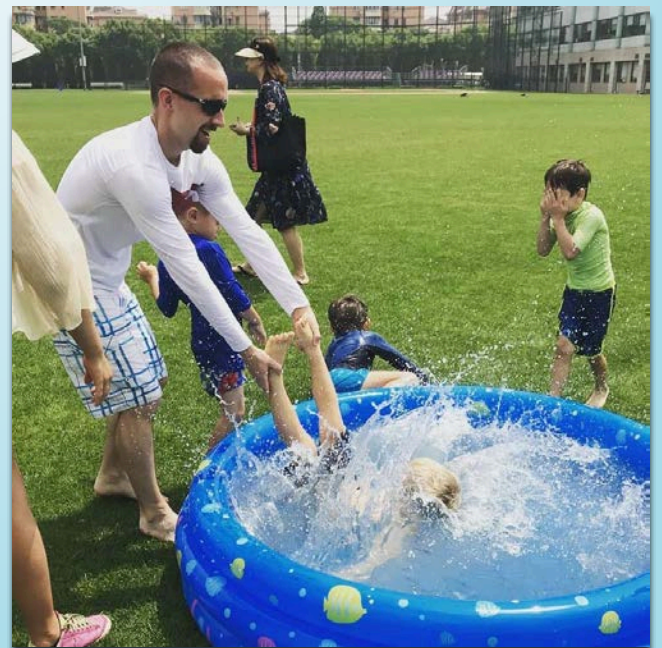
Water Day! Everyone's favorite day of school!