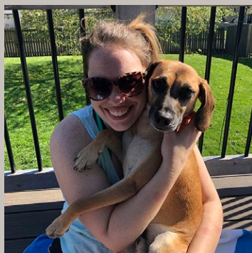
Favorite Animal: Dogs or Sharks