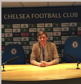
Favorite Sport: Soccer and Baseball