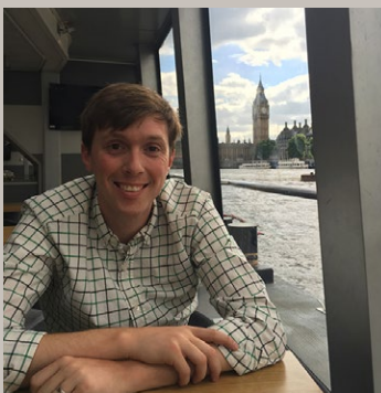
Harry Potter House: Hufflepuff