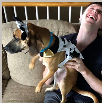
Favorite Animal: Dogs