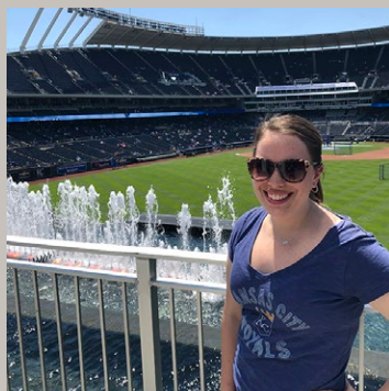
Favorite Sport: Baseball