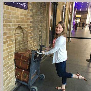
Harry Potter House: Ravenclaw