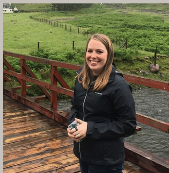
Favorite Hobbies: Reading and Vacation Planning