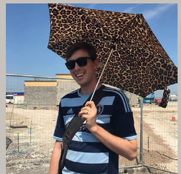
Favorite Season: Summer