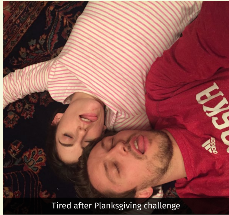
Tired after Planksgiving challenge