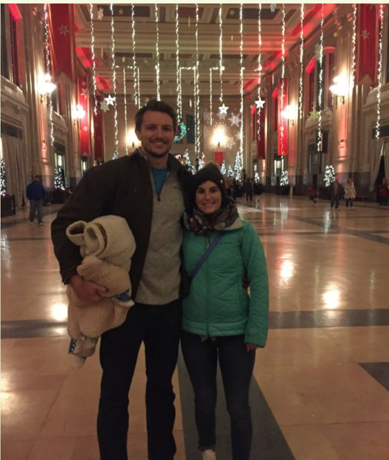
Christmas adventures in Kansas