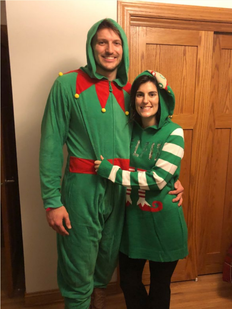
Dress up fun for Christmas in Kansas