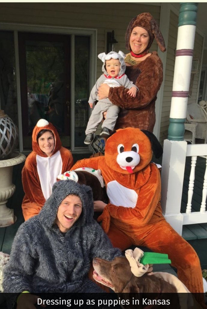
Dressing up as puppies in Kansas