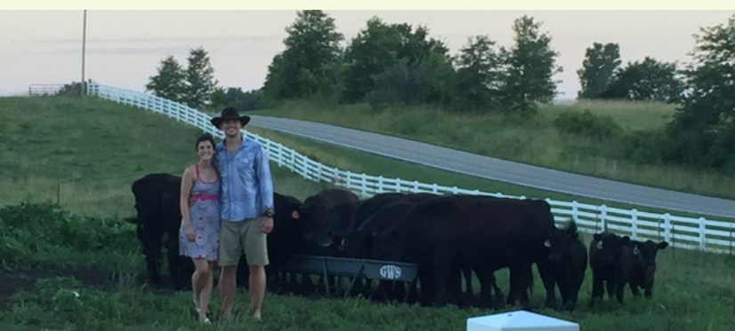
Feeding the cows in Kansas