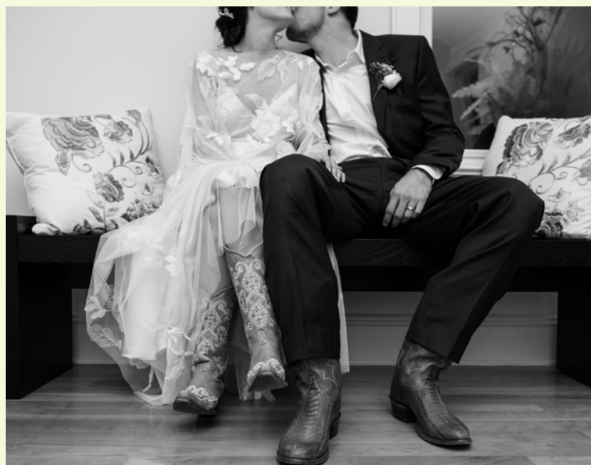
We love our cowboy boots