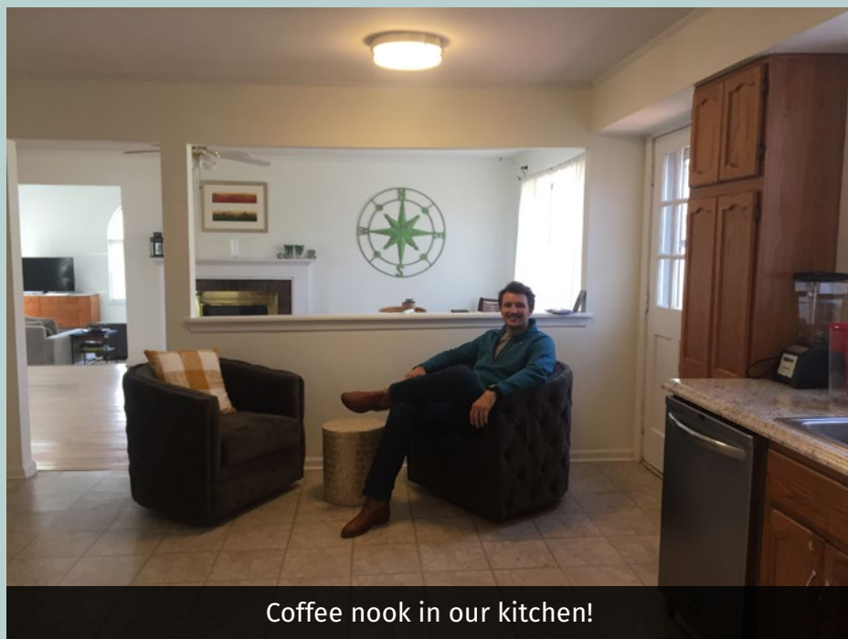
Coffee nook in our kitchen!

We spend a lot of time in our backyard. We enjoy cooking and eating on our back porch. We have flexible schedules, which means we get to spend amazing quality time together, and with a child when they arrive. We will be fortunate to not have to use daycare, and we have a very eager grandma down the road.