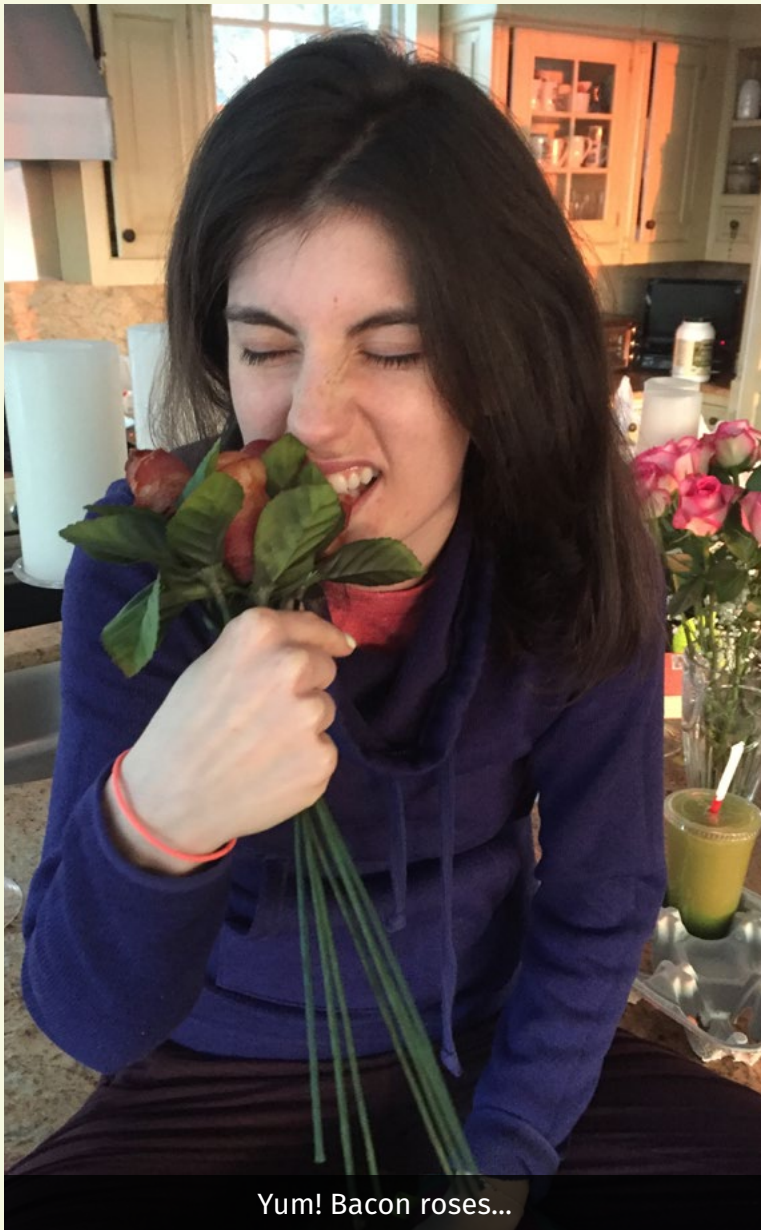
Yum! Bacon roses...