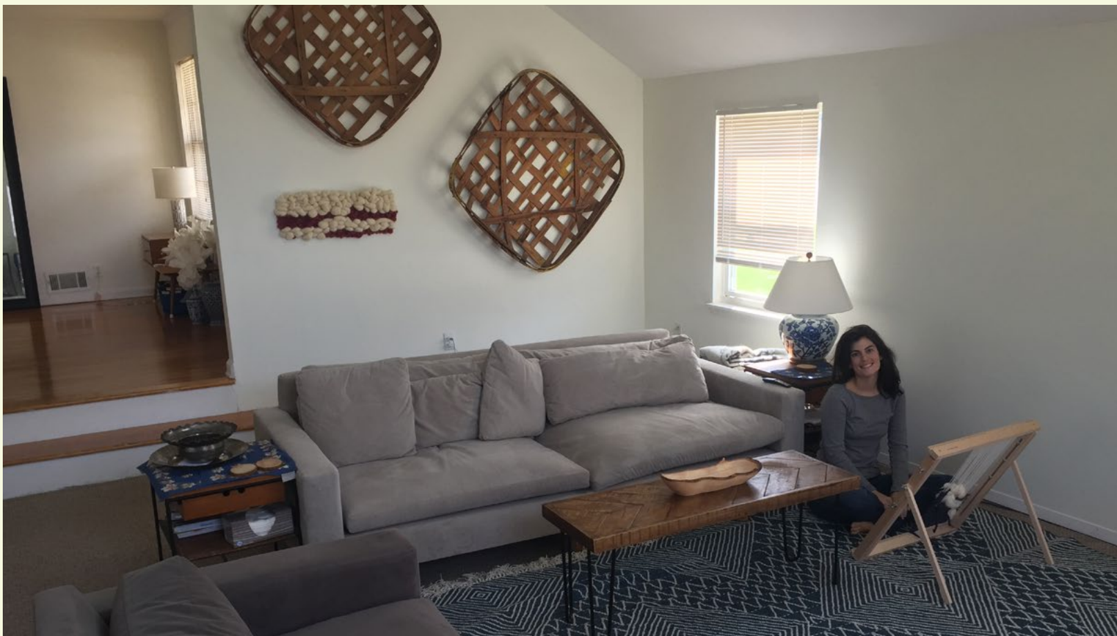
Our family room