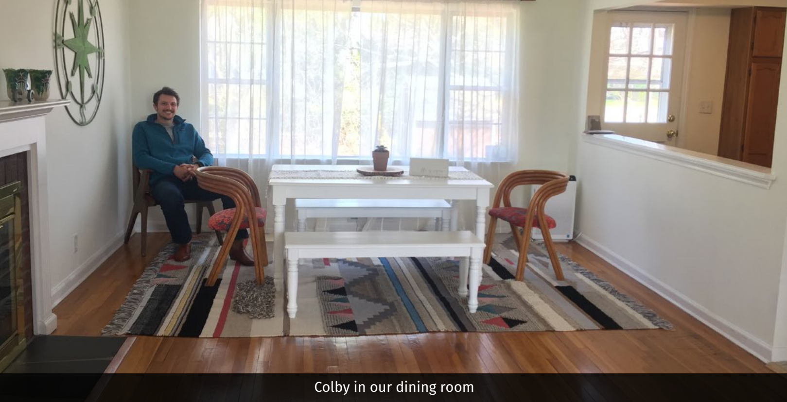
Colby in our dining room