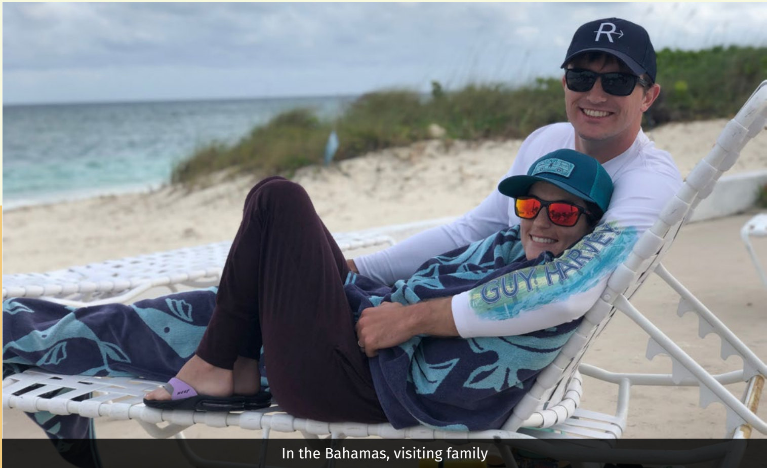
In the Bahamas, visiting family