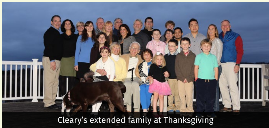
Cleary's extended family at Thanksgiving