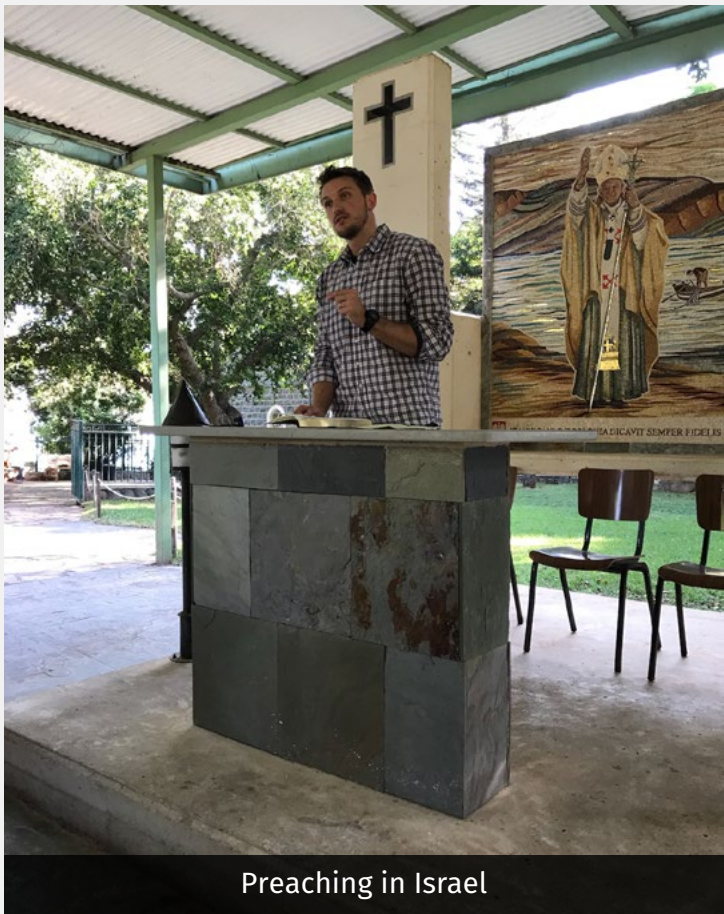
Preaching in Israel