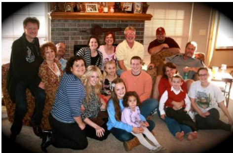
Some of my tribe – my parents, aunts and uncles, cousins, siblings, and nieces and nephews.