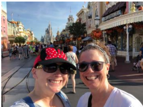
My mom and I love Disney!