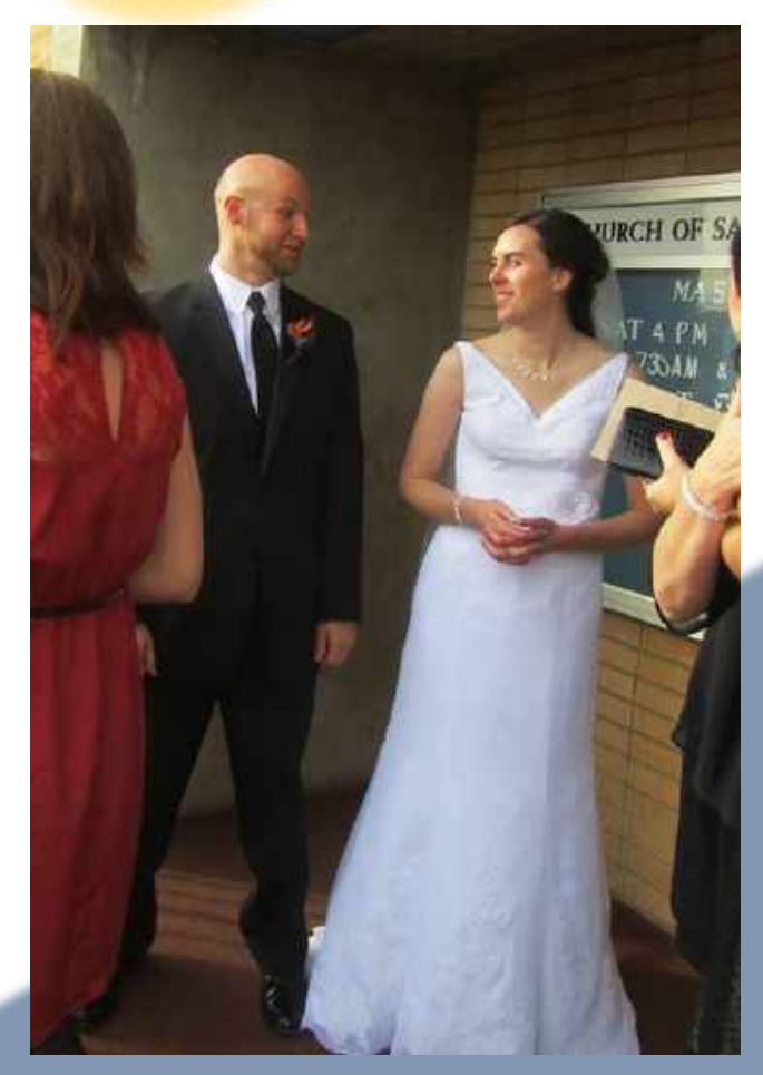
We got married on October 19, 2013 at the Catholic church we attend every weekend.