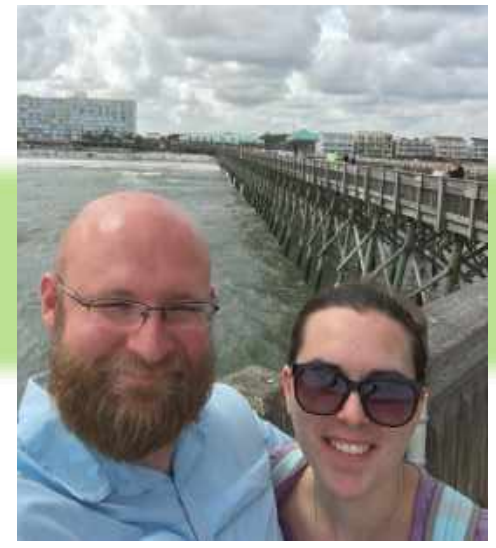
Since we are both teachers, we have time to take a vacation every summer. We have a refrigerator magnet from every trip.