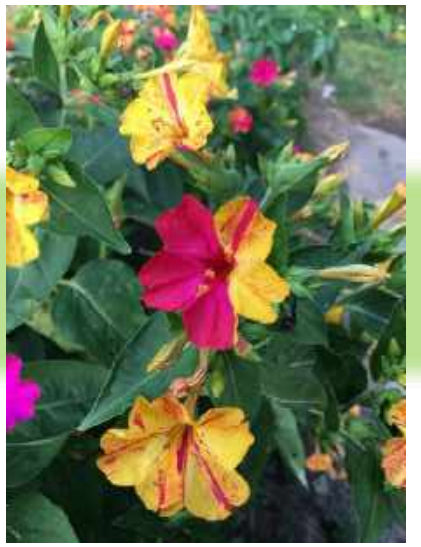
We grow four o'clocks in our garden every summer. We harvest the seeds in the fall so we can plant them in the spring.