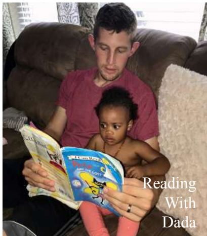
Reading With Dada