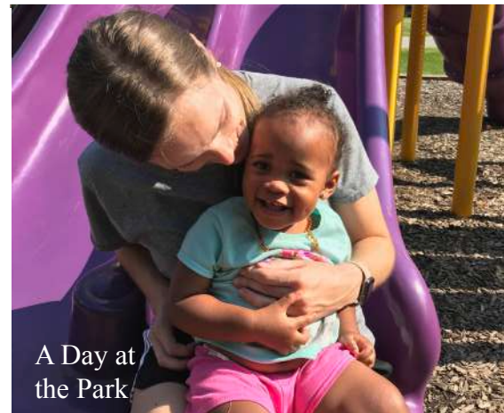
A Day at the Park