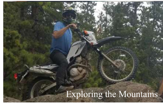
Exploring the Mountains