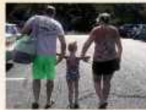
THE END OF A FUN DAY AT THE WATER PARK.