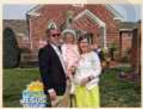
EASTER SUNDAY WITH MIMI AND POP AT OUR CHURCH!