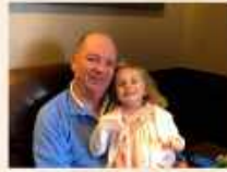
PAPI AND EMMA HANGING OUT ON FATHER'S DAY.