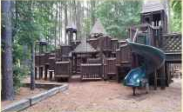
Local Parks in Our Area