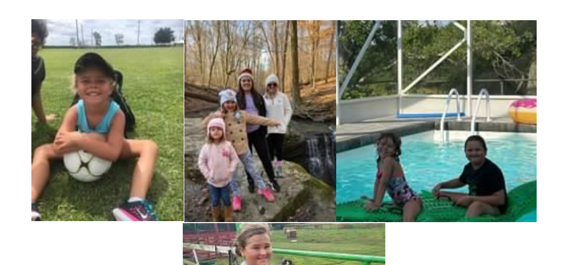
Outside activities are very important to us! We have kayaks for our lake, we love to hike, play in the pool, and find zoos and parks to enjoy!