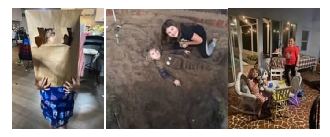
Although we are busy, we spend a lot of time at home and believe strongly in free play. The kids have toys, but they also create their own adventures both inside and outside. We don't mind messes at all it means they are learning!