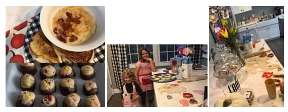
We love to cook and bake especially around sporting activities and holidays!