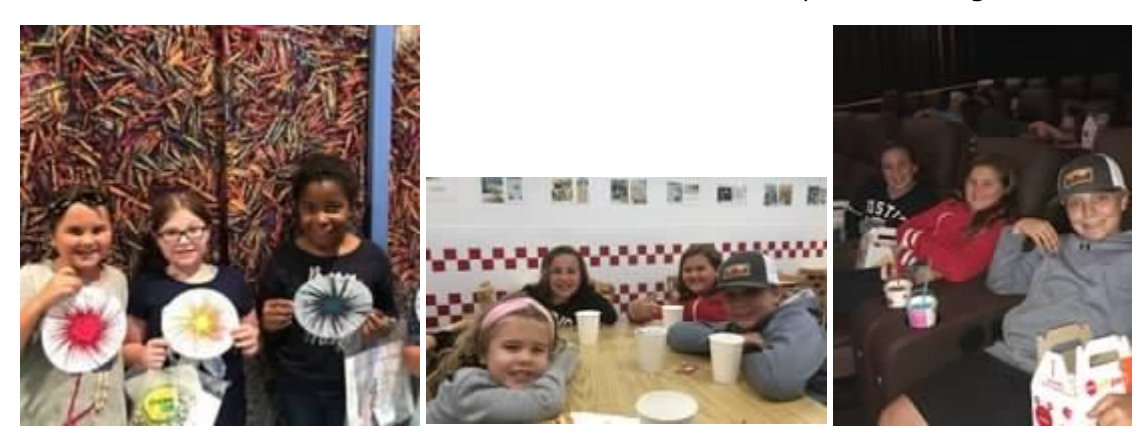
When friends come over to play, we put out snacks and they run around and in and out of the house! We love the noise and activity. We also take friends to movies, restaurants, and activities with us!