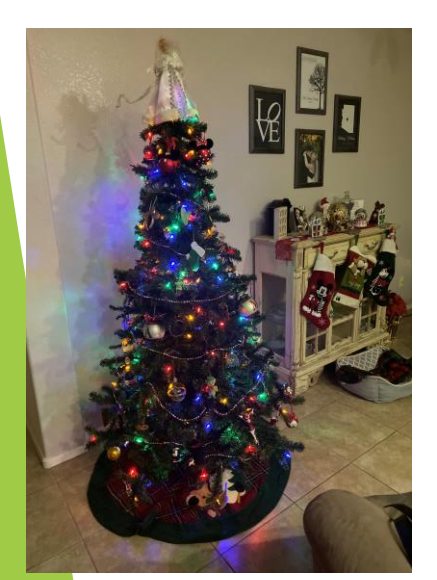
Freshly decorated tree