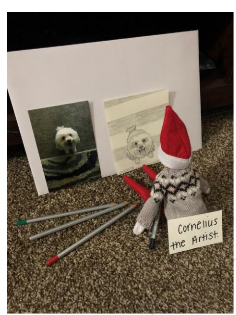
Elf on the Shelf