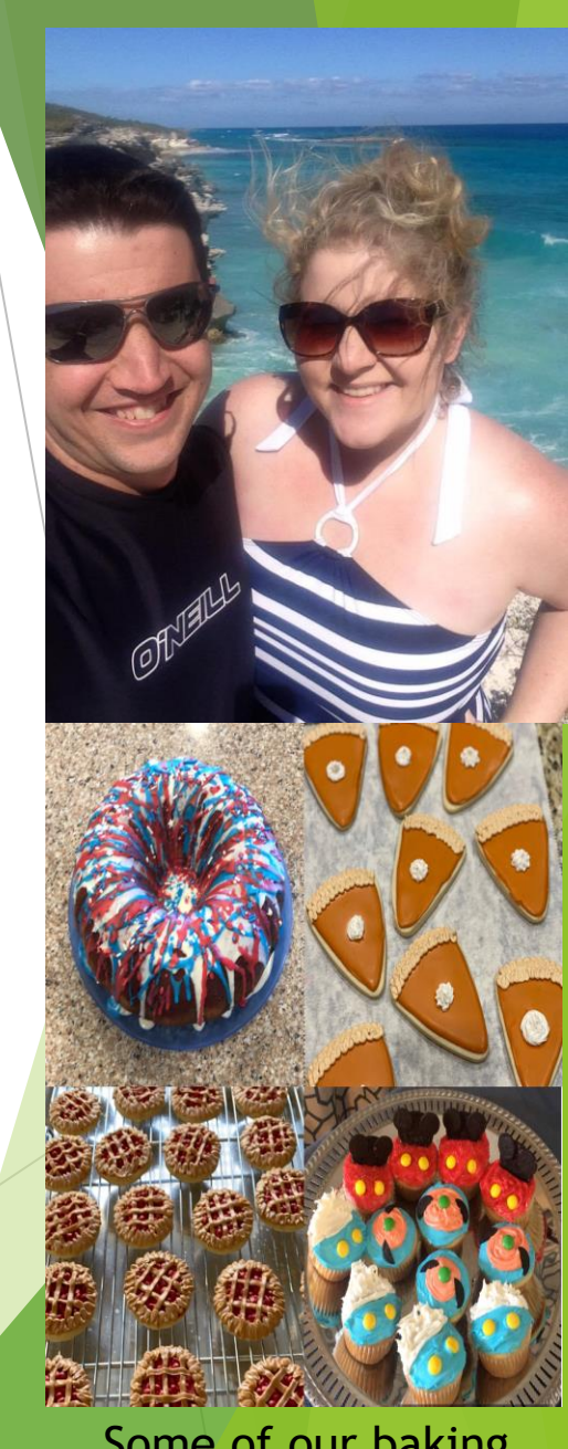
Some of our baking creations