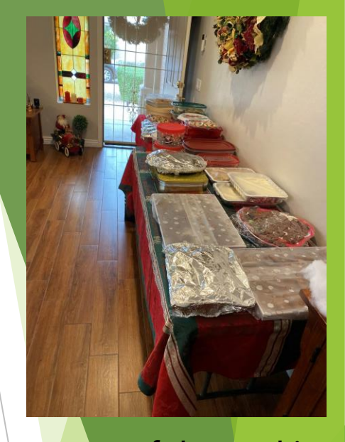
Just one of the cookie exchange tables!