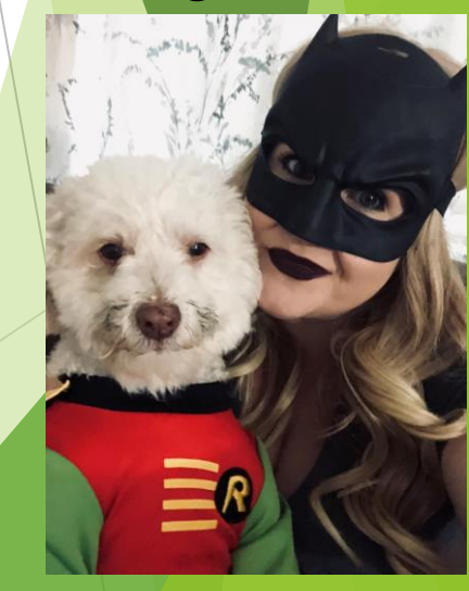
Batman and Robin, Halloween 2019