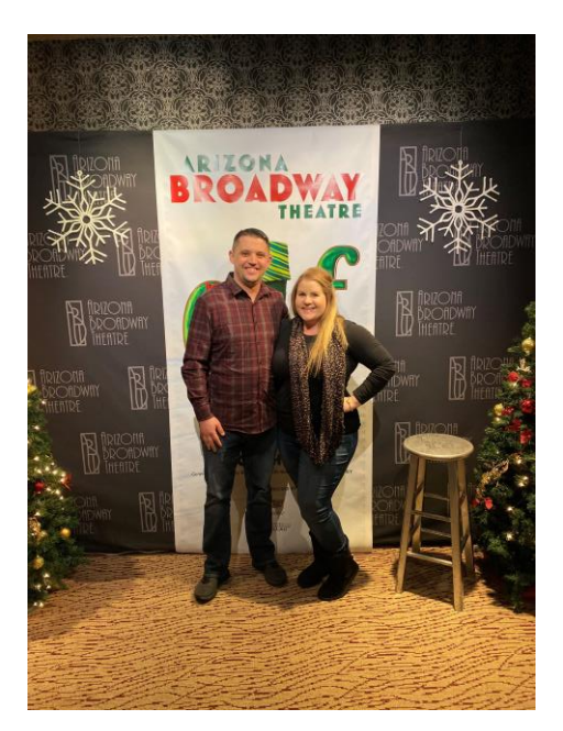
Seeing Elf on "Broadway"