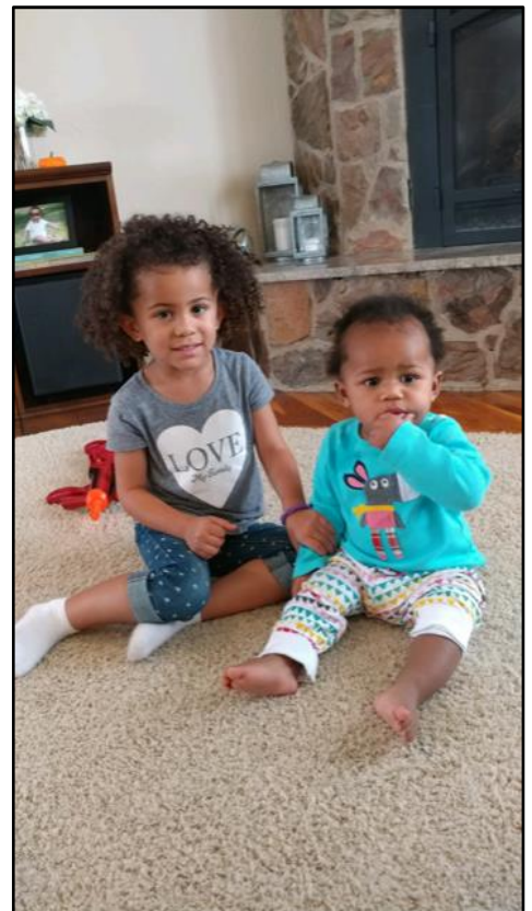
Our Friend's Foster Daughter

several different ethnicities. Just like the rest of our children, your child will come to love learning about different cultures. We