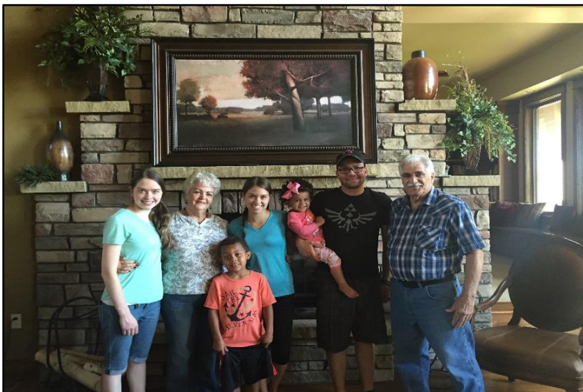
Sarah's Aunt and Uncle with the Kids

ethnically diverse. We have traveled to different countries, experiencing, valuing, and enjoying many different and diverse cultures.