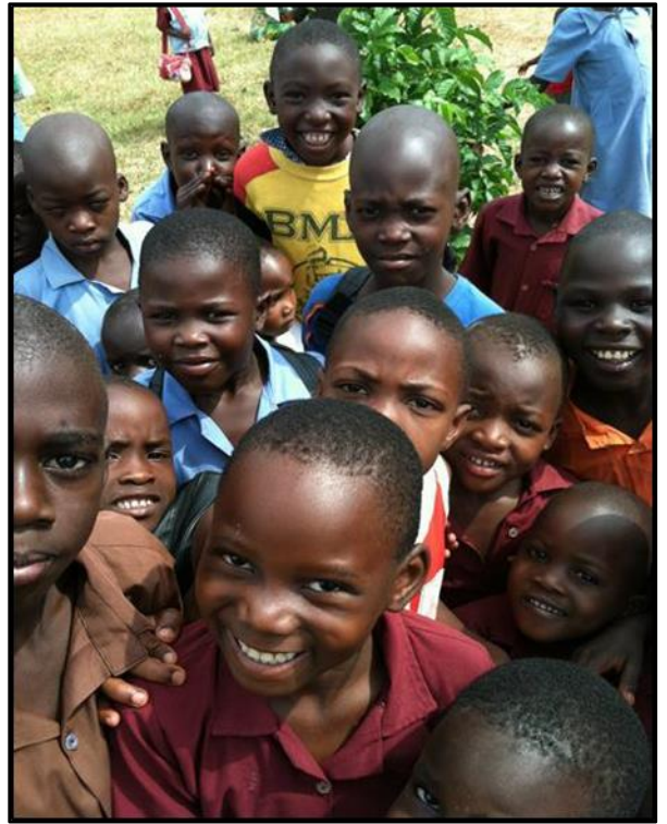
Children We Met in Uganda