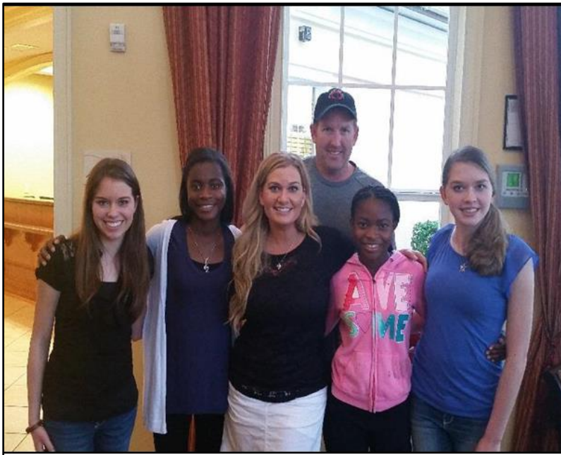
Our Previous Foster Children