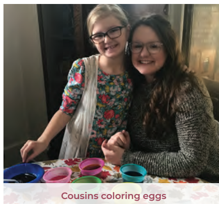
Cousins coloring eggs