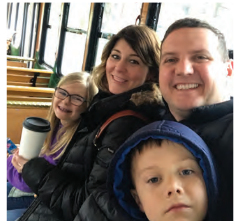
Downtown Trolley on Mother's Day