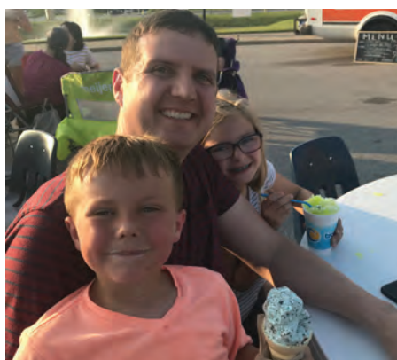
Food Truck Alley