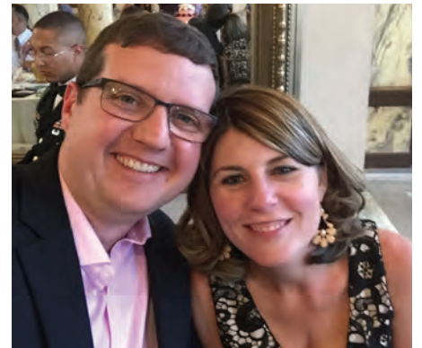
Celebrating the marriage of our friends!