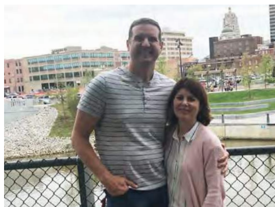
Enjoying a stroll through one of our city's parks