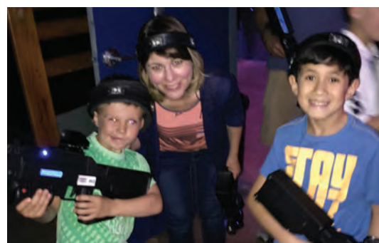
Mother-son outing playing laser tag