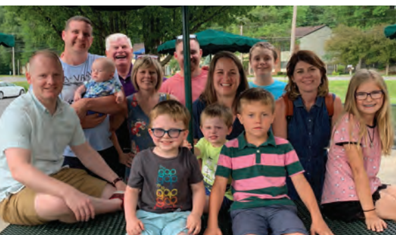
Sunny Sunday's are for cousins and the ice cream stand