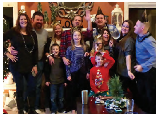
Neighbors and friends celebrating NYE