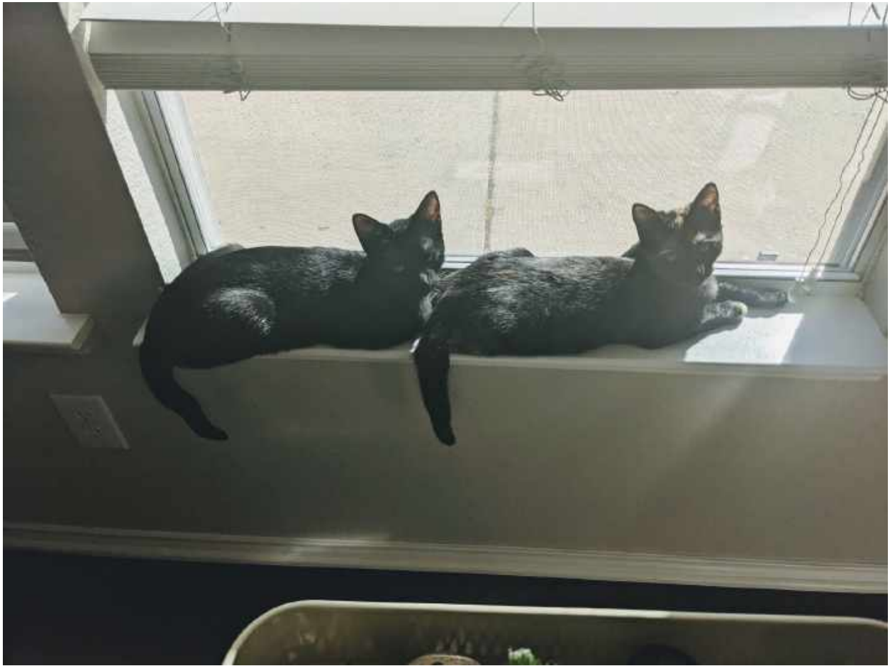
↑ Mouse and Flea - aka "the twins"