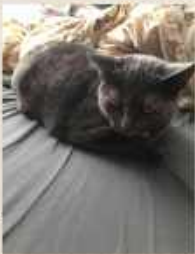
Lucy, the cat.