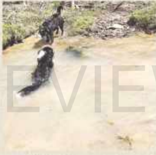
Banjo and Dolly