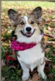
Hope, the Corgi