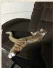
Tom, the cat.