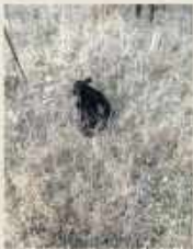
Cows and Baby Calves