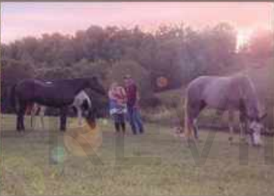
Many Horses, Sheep, and Cows