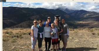
Hiking with family