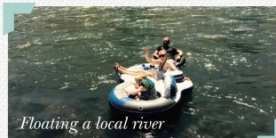
Floating a local river