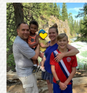
Hiking in Oregon