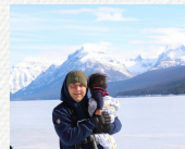
Glacier National Park, Montana