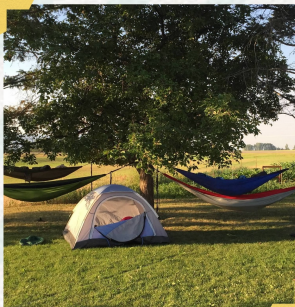
Camping with hammocks in Montana