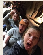
Disneyland with friends