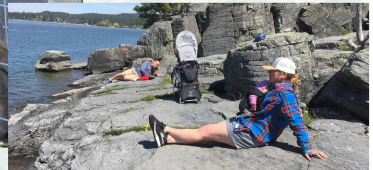
Relaxing at the lake