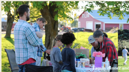
Family dinner and baseball game