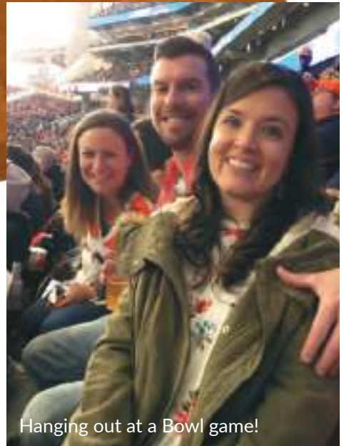
Hanging out at a Bowl game!