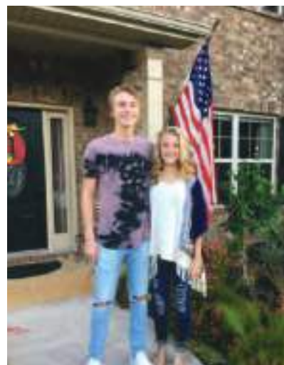
Family vacation in Playa Del Carmen