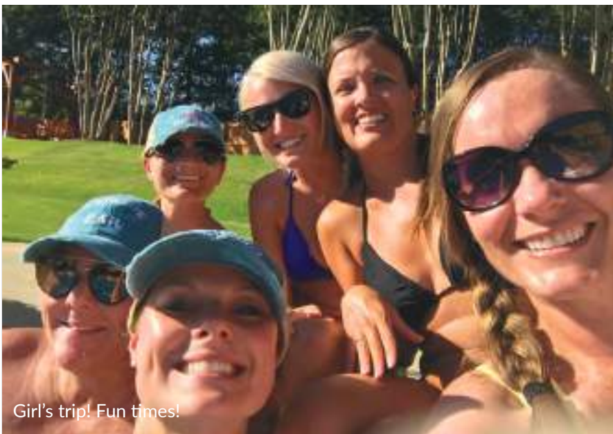
Girl's trip! Fun times!