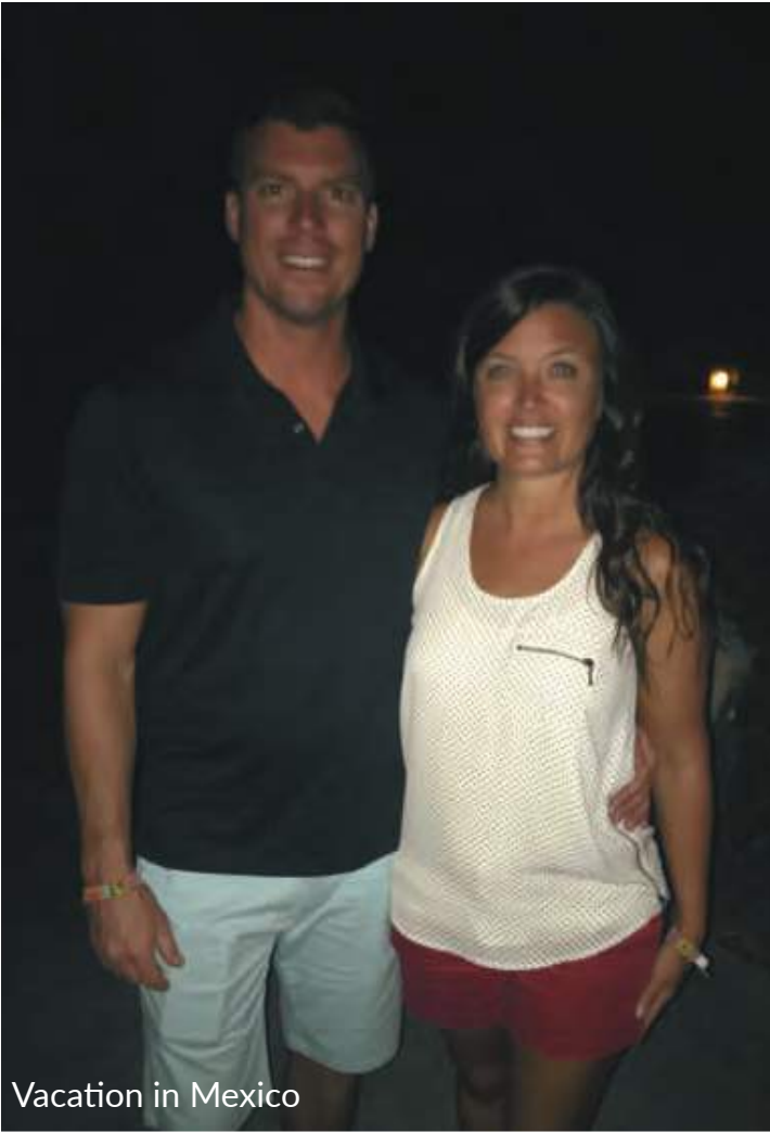
Vacation in Mexico