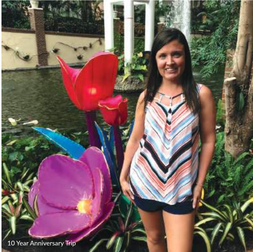
10 Year Anniversary Trip