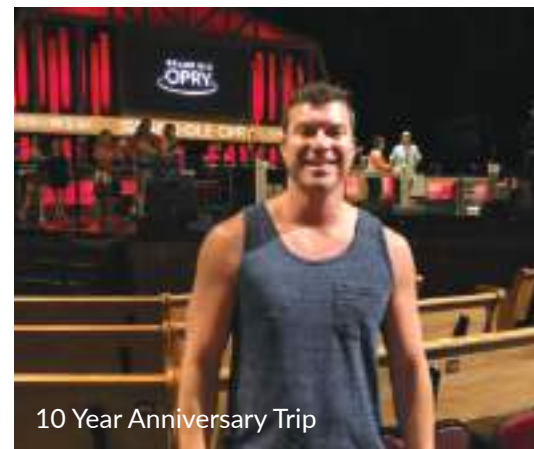
10 Year Anniversary Trip