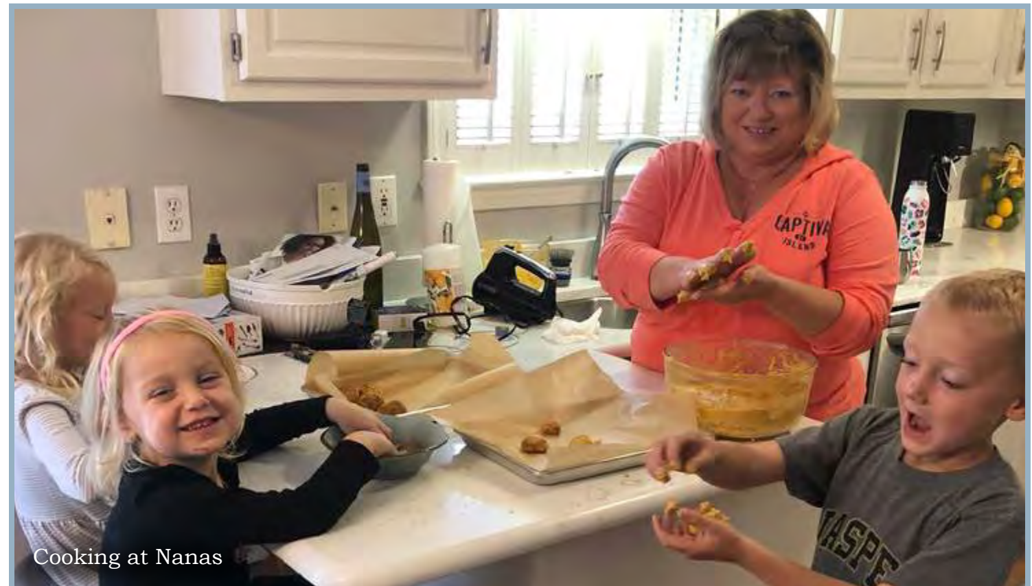
Cooking at Nanas