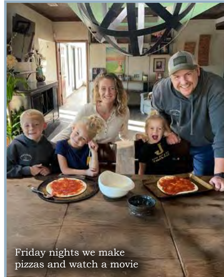
Friday nights we make pizzas and watch a movie