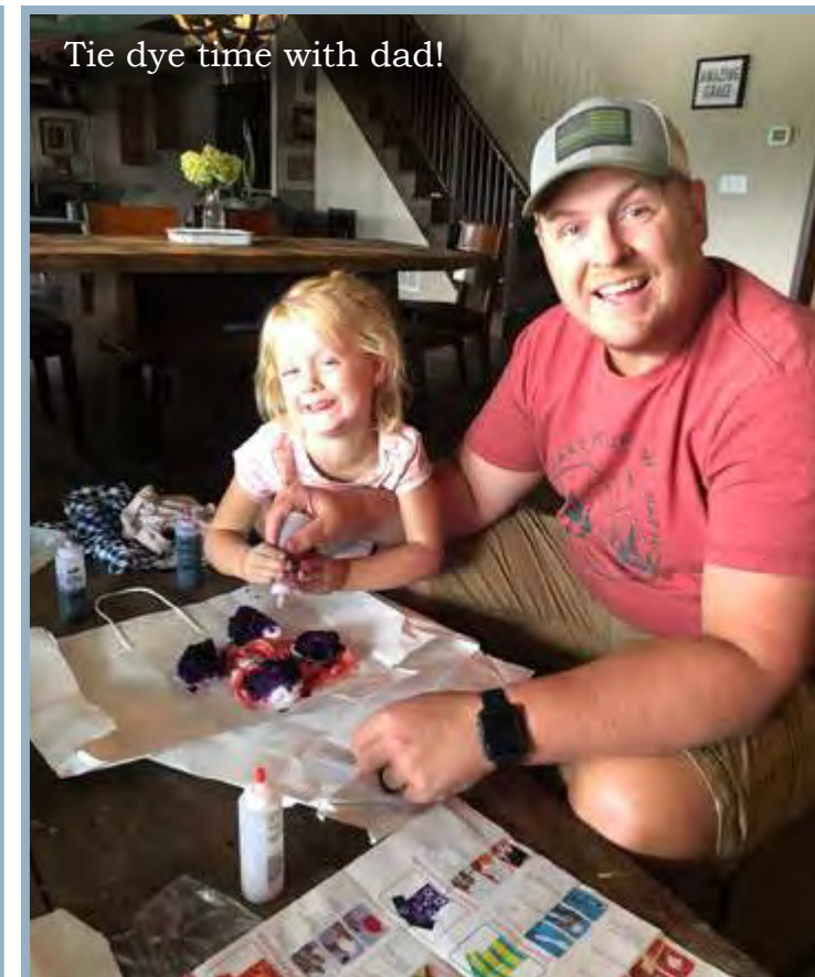
Tie dye time with dad!