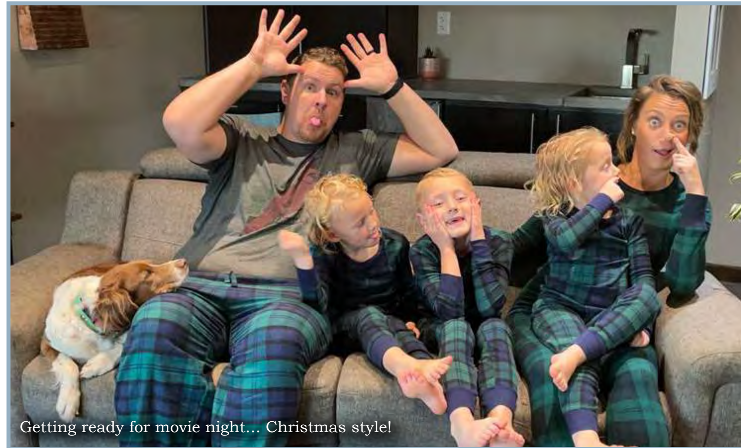
Getting ready for movie night... Christmas style!