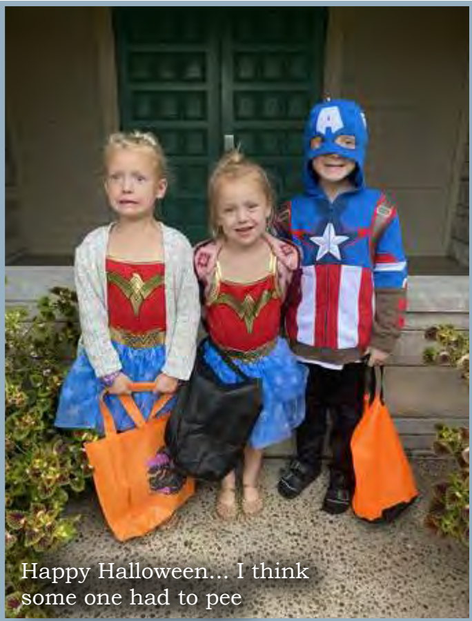
Happy Halloween... I think some one had to pee