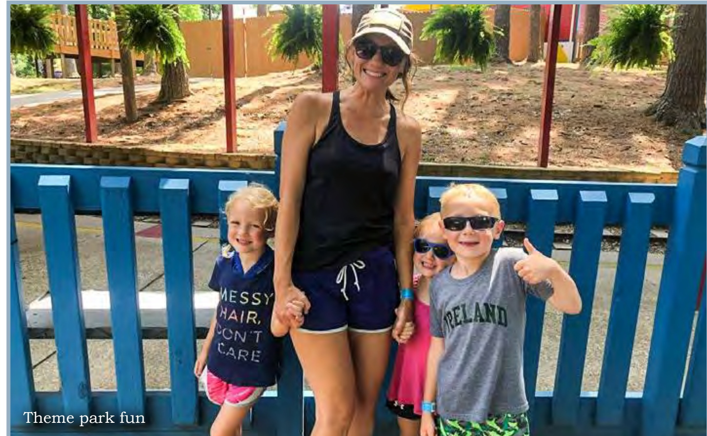
Theme park fun