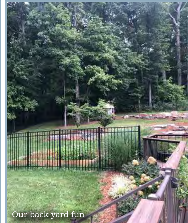
Our back yard fun