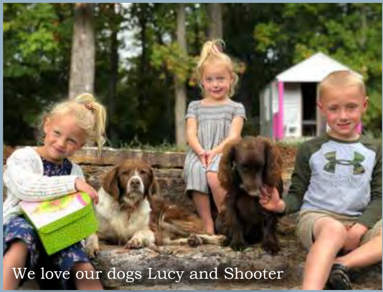
We love our dogs Lucy and Shooter