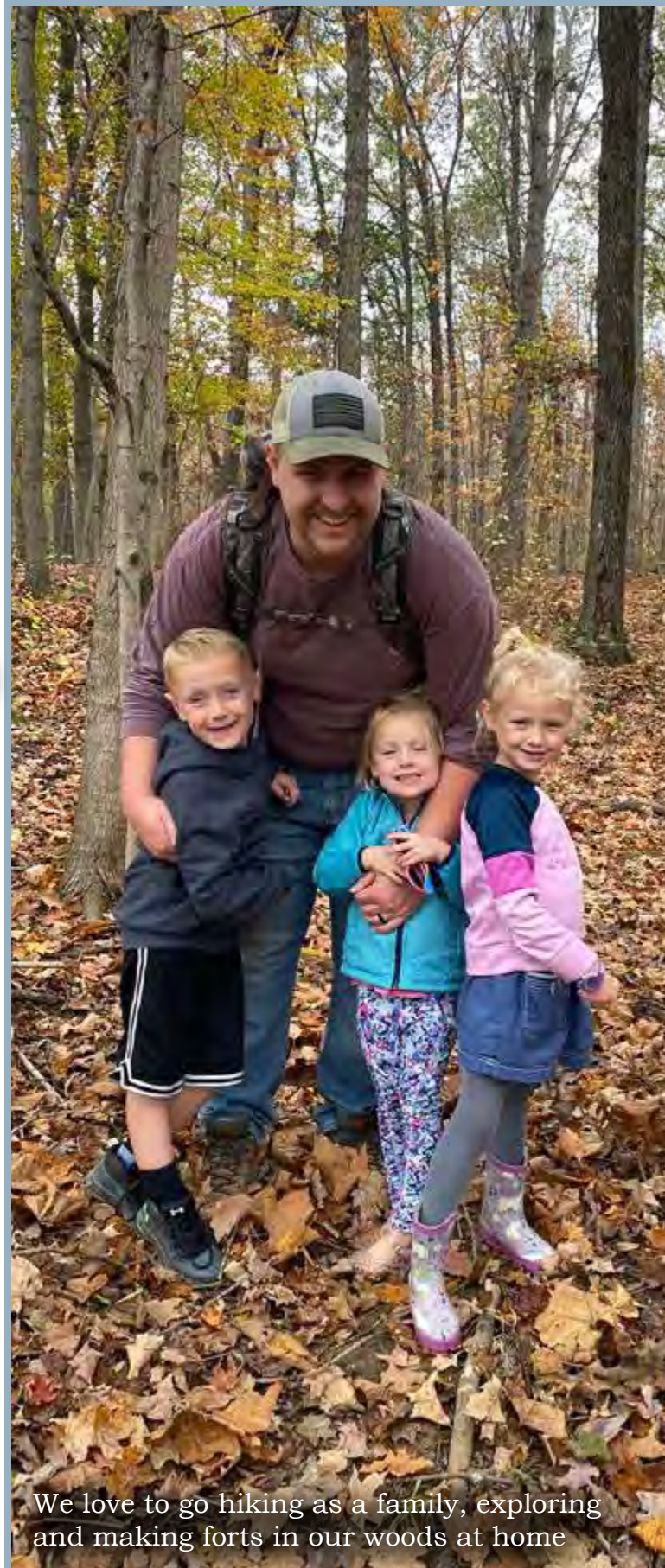
We love to go hiking as a family, exploring and making forts in our woods at home