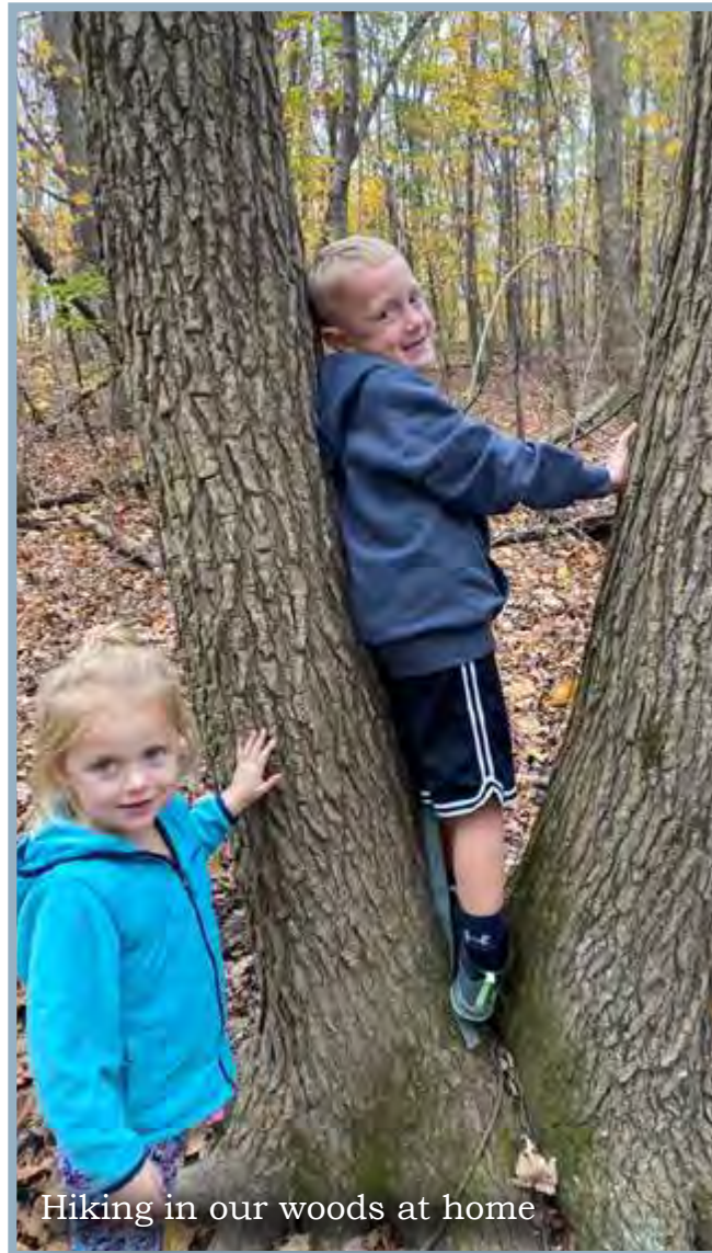
Hiking in our woods at home