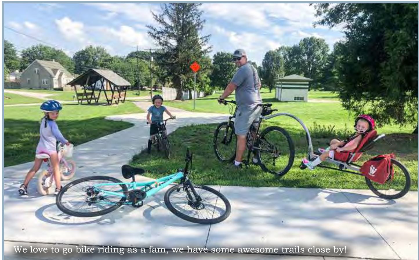
We love to go bike riding as a fam, we have some awesome trails close by!