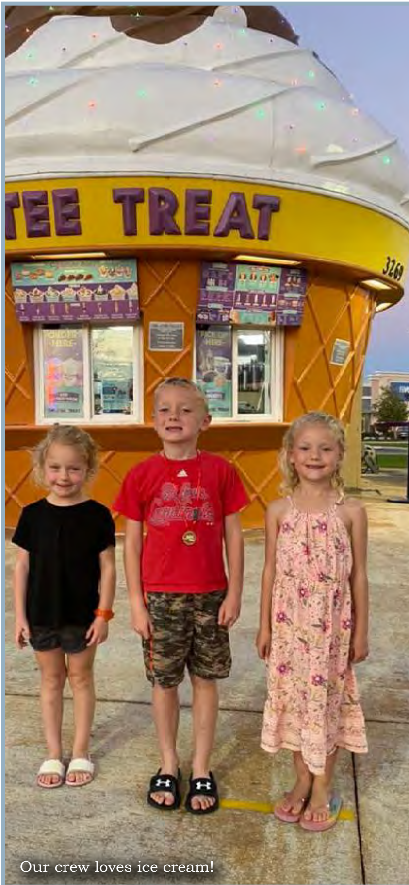
Our crew loves ice cream!