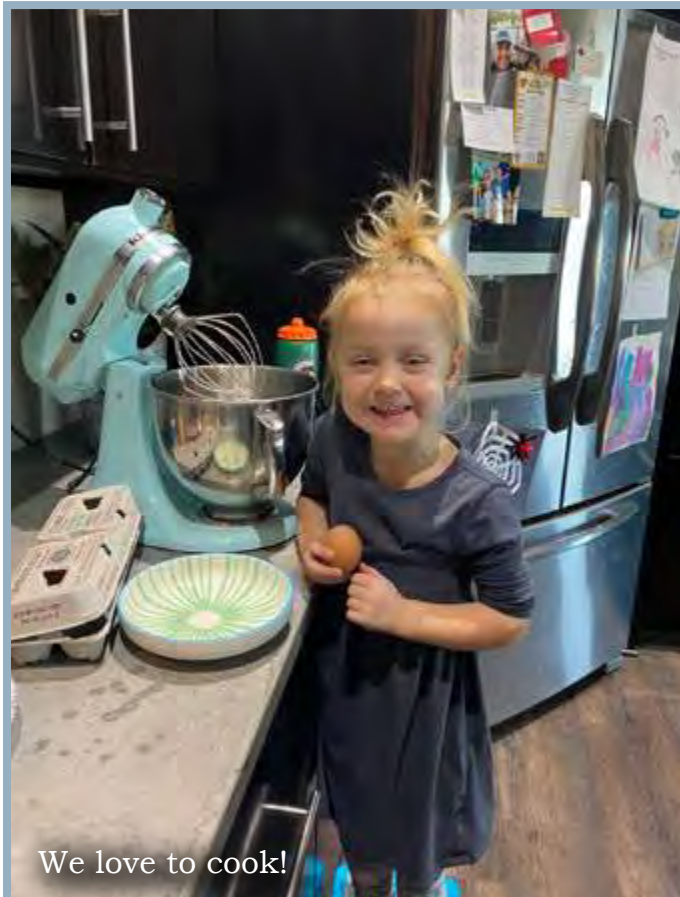
We love to cook!