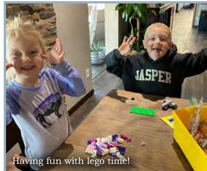
Having fun with lego time!