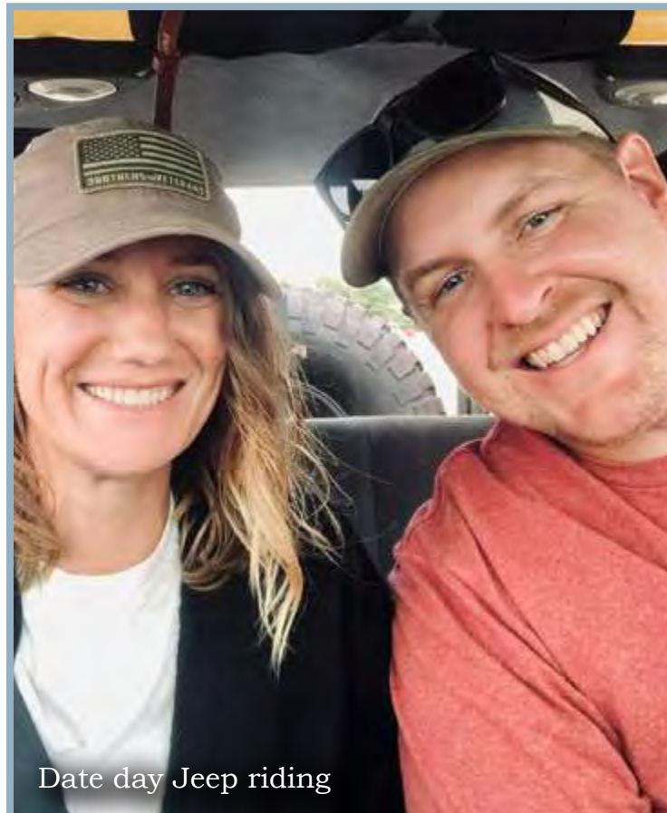
Date day Jeep riding