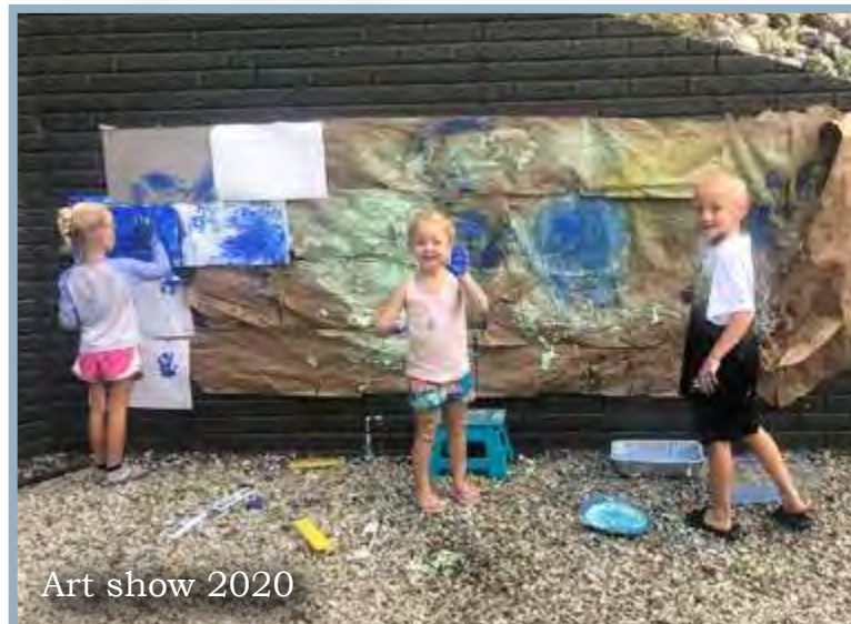
Art show 2020