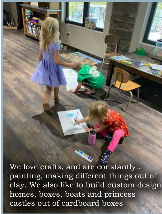
We love crafts, and are constantly.. painting, making different things out of clay. We also like to build custom design homes, boxes, boats and princess castles out of cardboard boxes

As a family, we love to enjoy the outdoors and all the fun activities that go along with being in nature. A few of our favorite outdoor activities include biking, hiking and kayaking. We also enjoy arts and crafts, making things for folks, and spending time with our friends. We host a weekly community group at our house with friends who all have a bunch of kiddos. We look forward to sharing these passions and exploring whatever passions this child has!