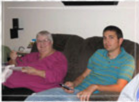
VISITING GG ANDREW'S