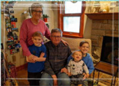
COUSIN HANK TIME AT NANA & PAPA'S