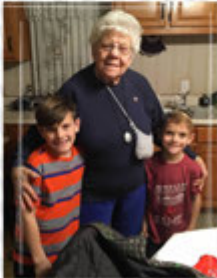
VISITING GG HAMAND