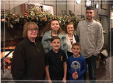
HOLIDAYS WITH MEMAW & AUNT REESIE