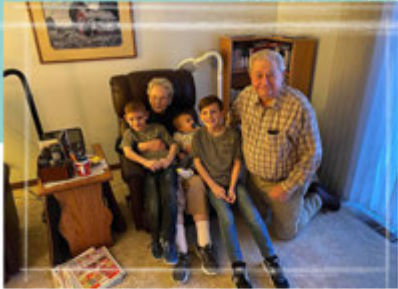
HOLIDAYS @ GG OLSON'S