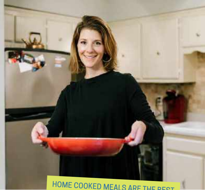
HOME COOKED MEALS ARE THE BEST