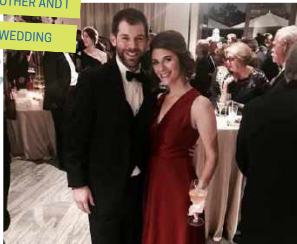
AT A WEDDING