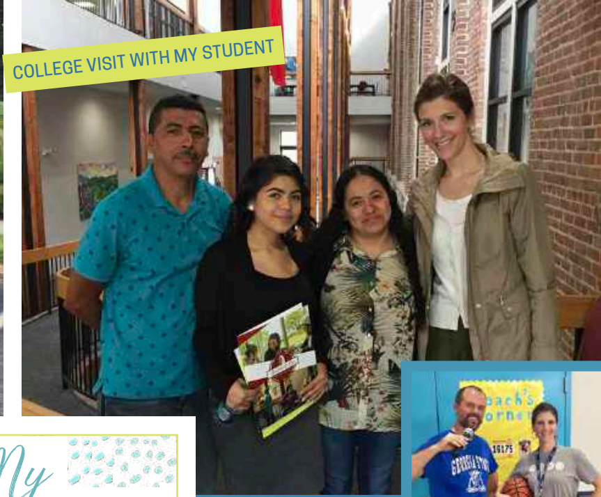
COLLEGE VISIT WITH MY STUDENT