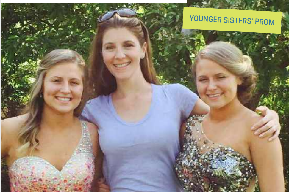
YOUNGER SISTERS' PROM

WE TAKE A COUPLE FAMILY VACATIONS EVERY YEAR, ONE OF WHICH IS ALWAYS A BEACH VACATION. My mom and I are up before sunrise with my niece and nephew, the first to the water, carrying all the toys and sand buckets. My favorite!