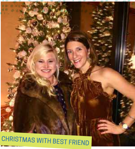
CHRISTMAS WITH BEST FRIEND

I LOVE MY CITY WHICH IS KNOWN FOR GREAT MUSIC AND ITS WELCOMING, FRIENDLY, DIVERSE AND VIBRANT SPIRIT. We are located in the hills, which is breath-taking, and have every season. I love being outside, feeling the warm sun on my face, and hiking through a canopy of trees.