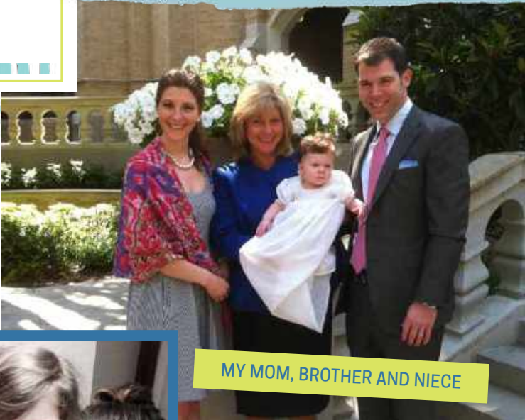
MY MOM, BROTHER AND NIECE