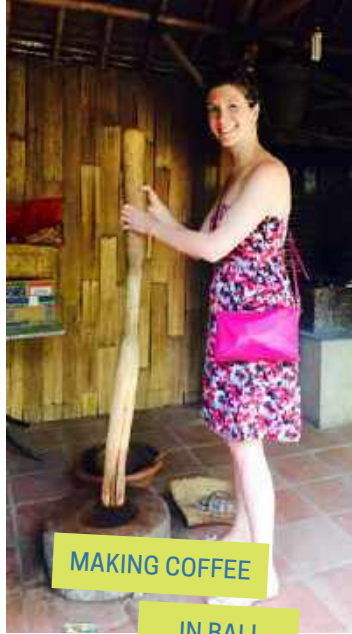
MAKING COFFEE IN BALI