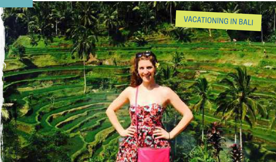
VACATIONING IN BALI