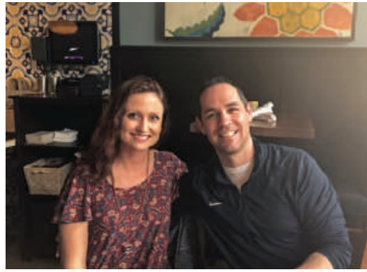
Brunch in Asheville, NC