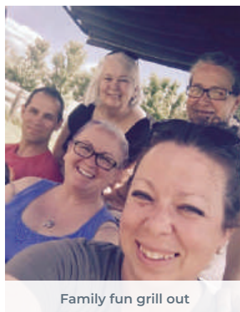
Family fun grill out