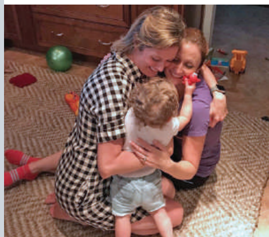
Cuddle time with family