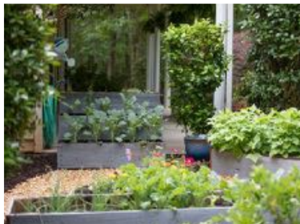
One of our gardens

"A house is made with walls and beams, A home is built with love and dreams."