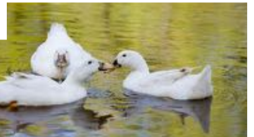
Our ducks, "Honk, Petunia, and Miss Waddlesworth."