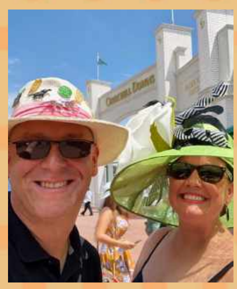
Celebrating the Kentucky Derby