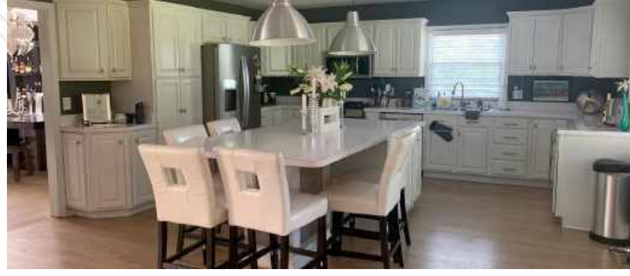
Kitchen! We love to entertain!