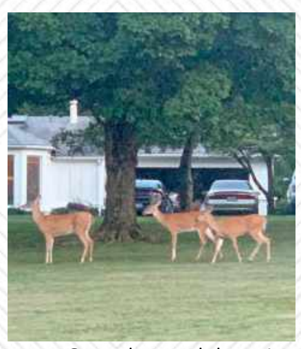
Our deer visitors!