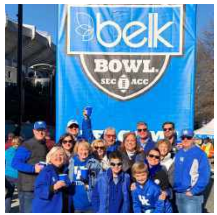
Football Bowl Game!