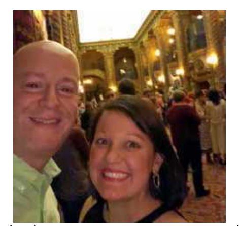
We love music concerts