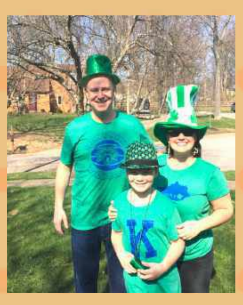
Saint Patrick's Day fun!