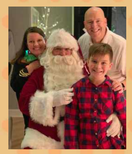
Family Christmas Party with a visit from Santa each year!