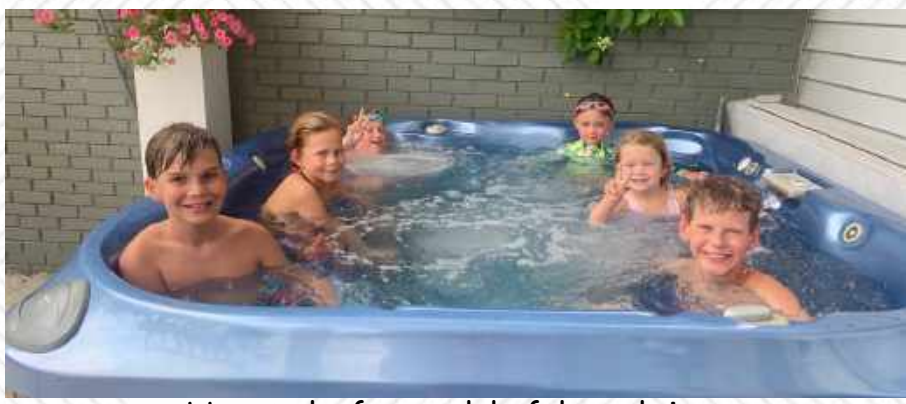
Hot tub fun with friends!