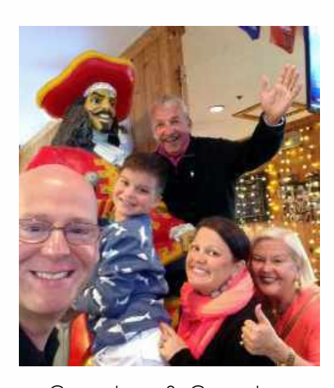
Grandma & Grandpa