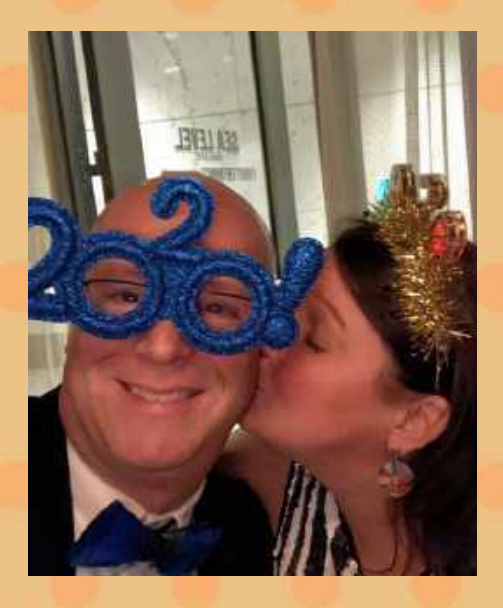
A new years kiss!