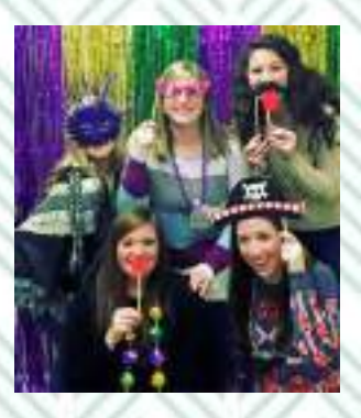
Having photo fun with Kim's friends