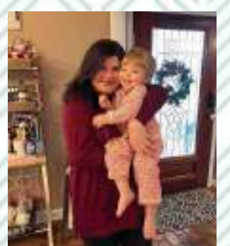
Snuggling with Grammy