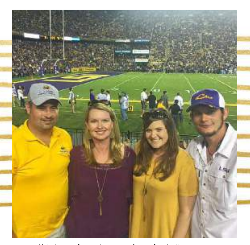
We have fun going to college football games and watching our favorite teams play!