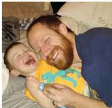
GIGGLES & TICKLES