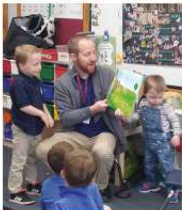
Drop everything & read!