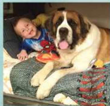
Best cuddle buddy

We also have 2 cats: Tigger & Pretty Kitty Bob!