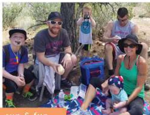
sun & fun