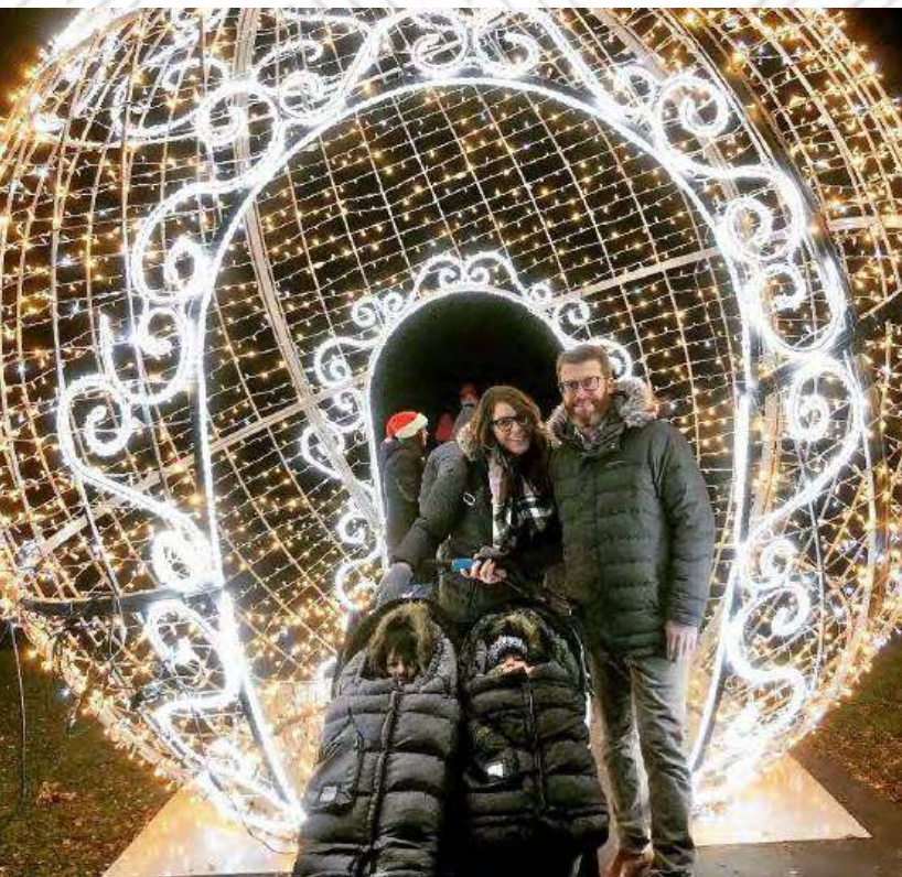
DETROIT ZOO LIGHTS