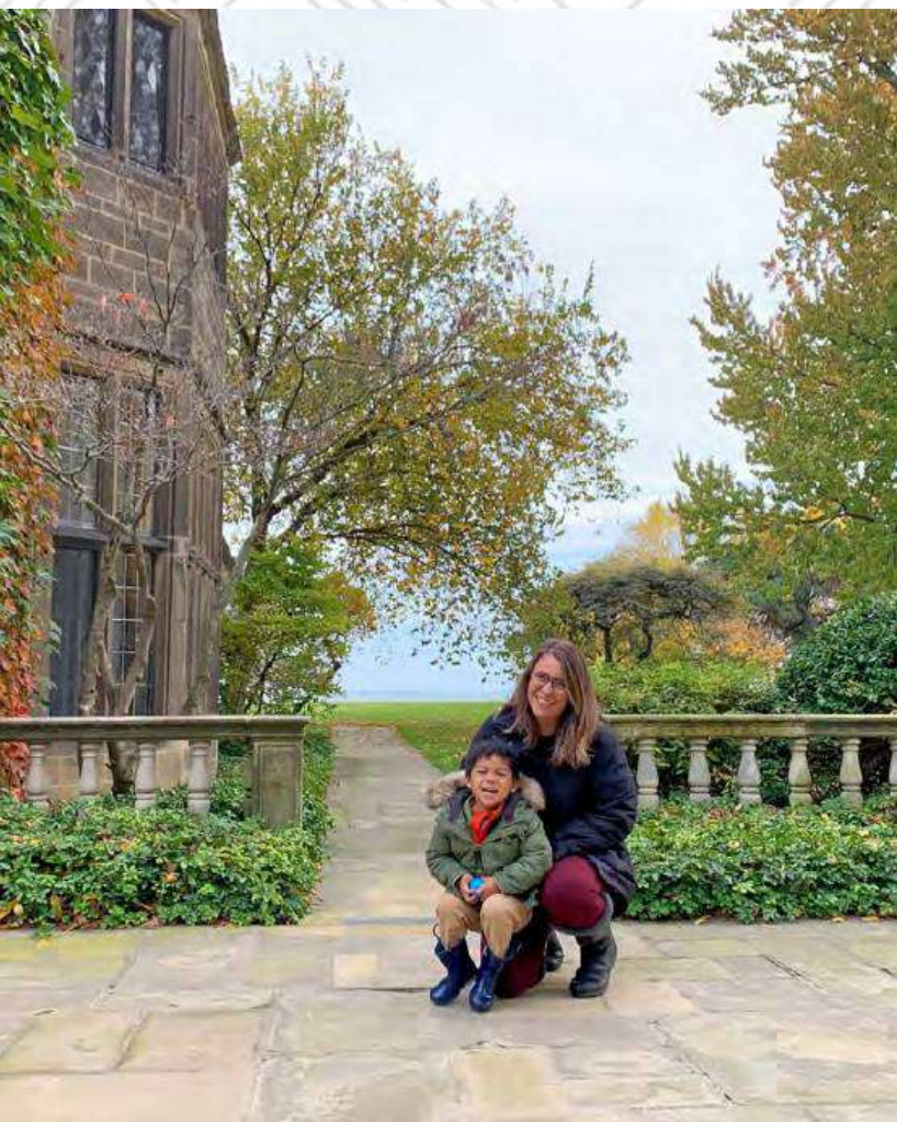
HISTORIC FORD HOUSE