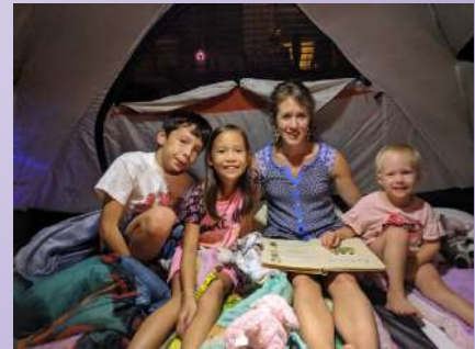
Backyard Campout with Cousins