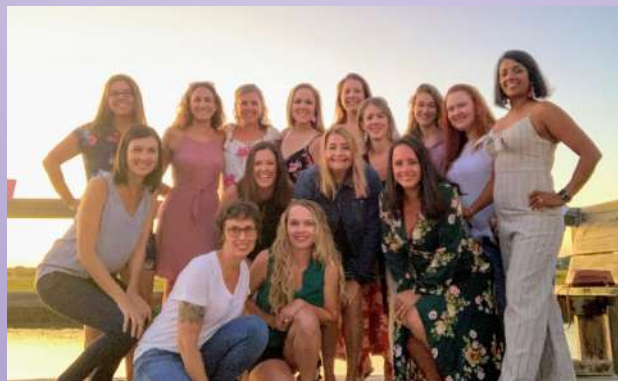
At the beach with some friends