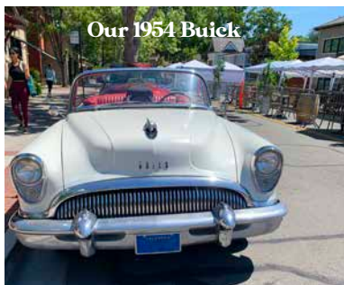
Our 1954 Buick