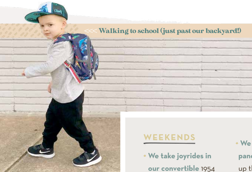
Walking to school (just past our backyard!)

We also own a vacation home in Lake Tahoe that we travel to on occasional weekends. It's a 3-bedroom cabin by the lake. This place is special to us because that's where our love story began and we want to share all the beauty of Lake Tahoe with our family and friends.