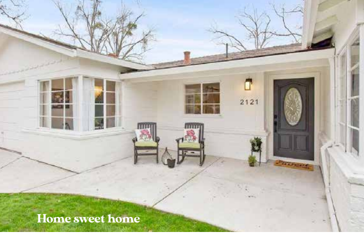
Home sweet home