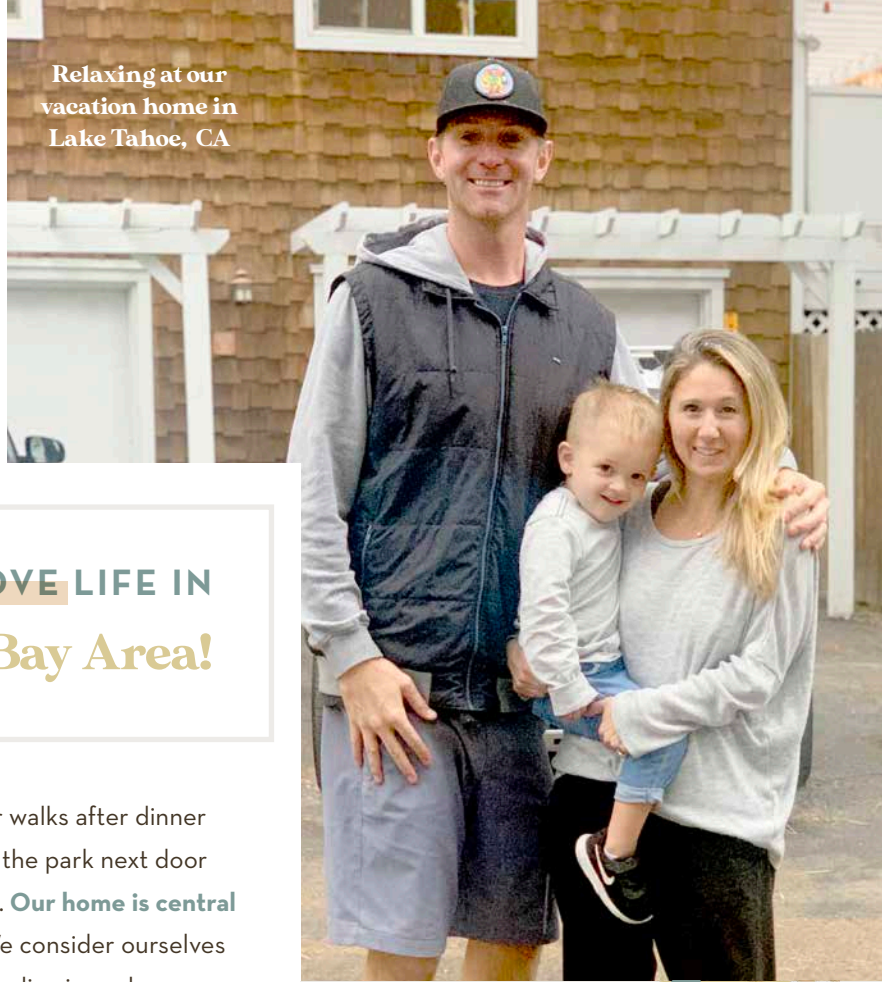
Relaxing at our vacation home in Lake Tahoe, CA