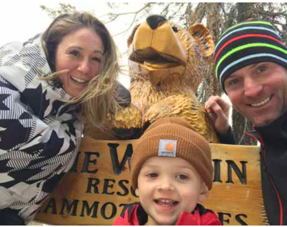
Family ski trip