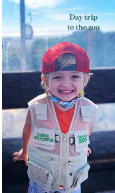
Day trip to the zoo