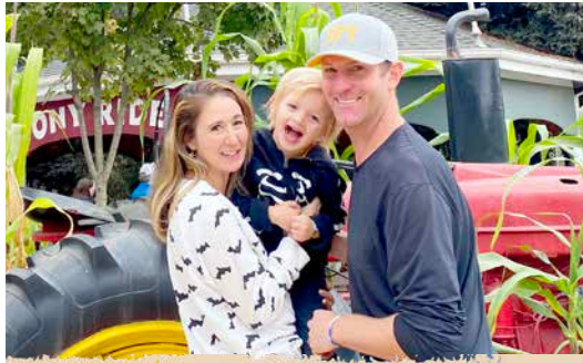
Family fun at our local pumpkin patch

WE ARE A HOUSE FULL OF LAUGHTER, LOVE and lots and lots (and LOTS) of hugs.