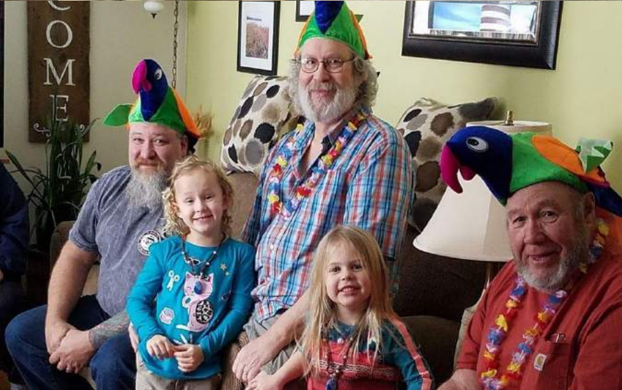
River with all 3 Papas and her cousin.