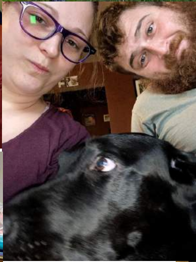
School conferences via Zoom (Grue takes education seriously)