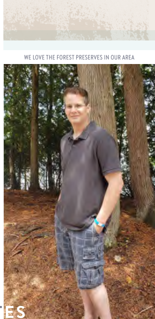
WE LOVE THE FOREST PRESERVES IN OUR AREA