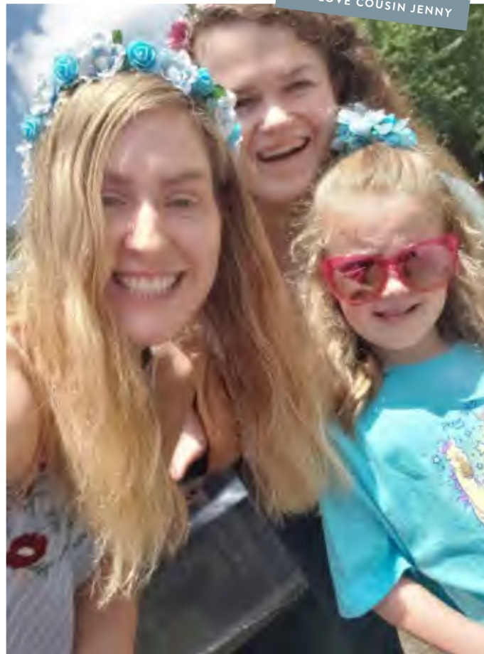
WE LOVE COUSIN JENNY