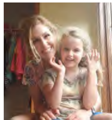
SUNNY DAYS WITH MOM