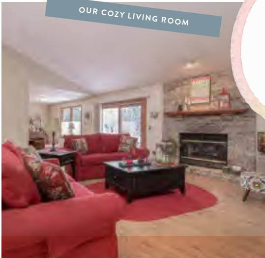
OUR COZY LIVING ROOM