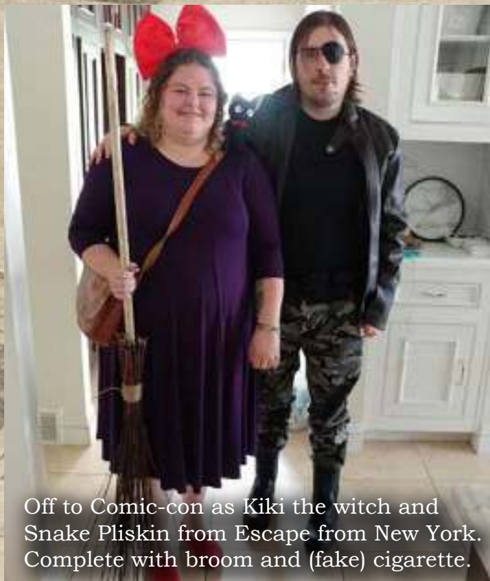
Off to Comic-con as Kiki the witch and Snake Pliskin from Escape from New York. Complete with broom and (fake) cigarette.