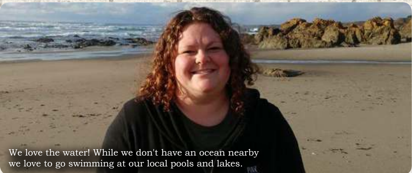
We love the water! While we don't have an ocean nearby we love to go swimming at our local pools and lakes.