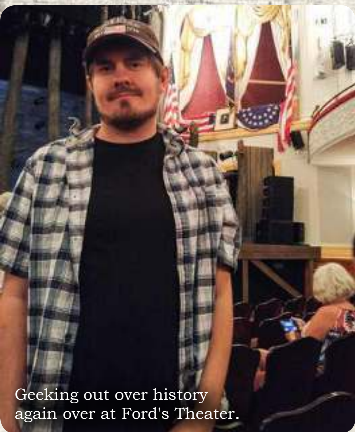
Geeking out over history again over at Ford's Theater.