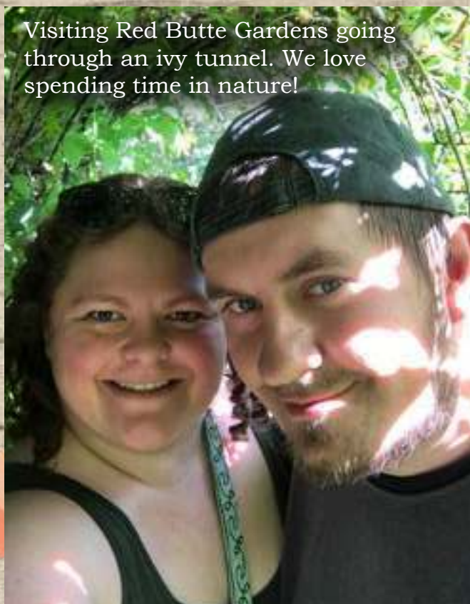
Visiting Red Butte Gardens going through an ivy tunnel. We love spending time in nature!