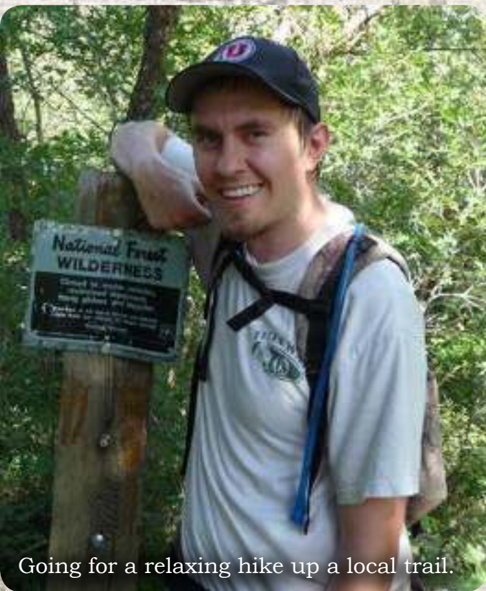
Going for a relaxing hike up a local trail.