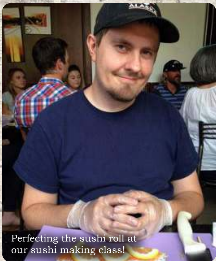
Perfecting the sushi roll at our sushi making class!