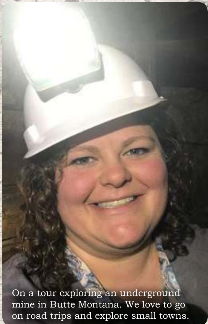
On a tour exploring an underground mine in Butte Montana. We love to go on road trips and explore small towns.