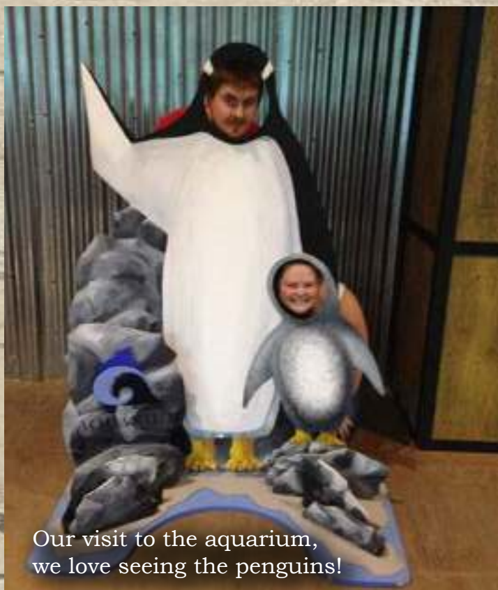
Our visit to the aquarium, we love seeing the penguins!