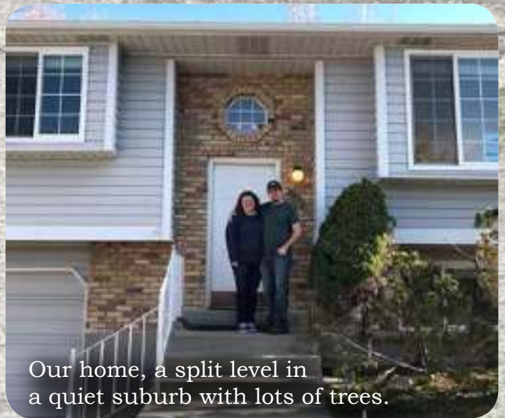
Our home, a split level in a quiet suburb with lots of trees.

We live in a suburb outside of Salt Lake City in a quiet neighborhood with lots of trees, sidewalks, and parks within walking distance. We bought our home in 2017; it is a split-level home with lots of natural light and a back patio that our dog Jasper loves to sunbathe on. During the summer months, we enjoy spending time outdoors, relaxing in our hammock, or making dinner on the grill.