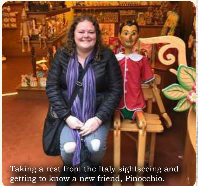
Taking a rest from the Italy sightseeing and getting to know a new friend, Pinocchio.

I have always wanted to be a mother and can't wait to share new experiences with a little one. Whether building snowmen, making Sunday morning pancakes, or planting seeds in the garden, I can't wait to introduce this child to the amazing world around them. With many wonderful memories from my own childhood, I hope to raise this child in an environment full of wonder and whimsy.