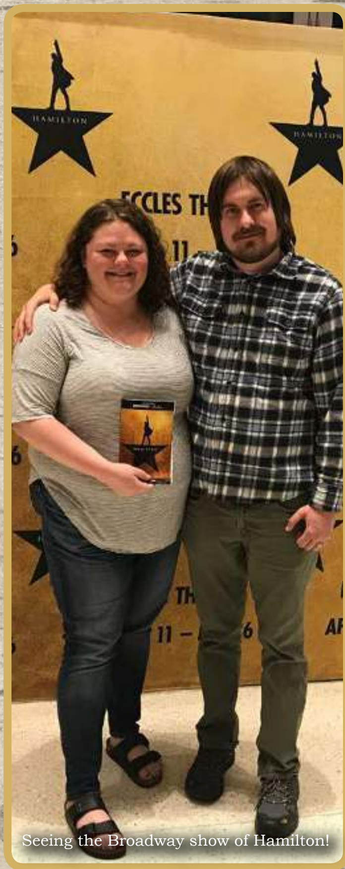
Seeing the Broadway show of Hamilton!

After being married for a few years, we discovered it was possible that any biological child we had might be born with a potentially serious health condition. We decided not to have children of our own and to pursue adoption. We are so excited to adopt a little one and start the journey of growing our family through adoption.