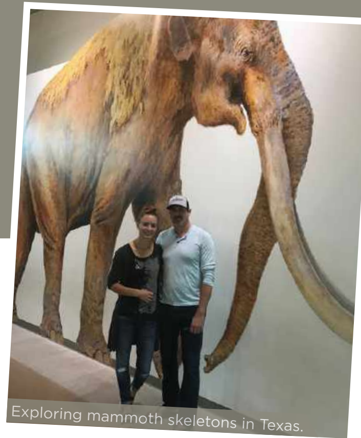
Exploring mammoth skeletons in Texas.