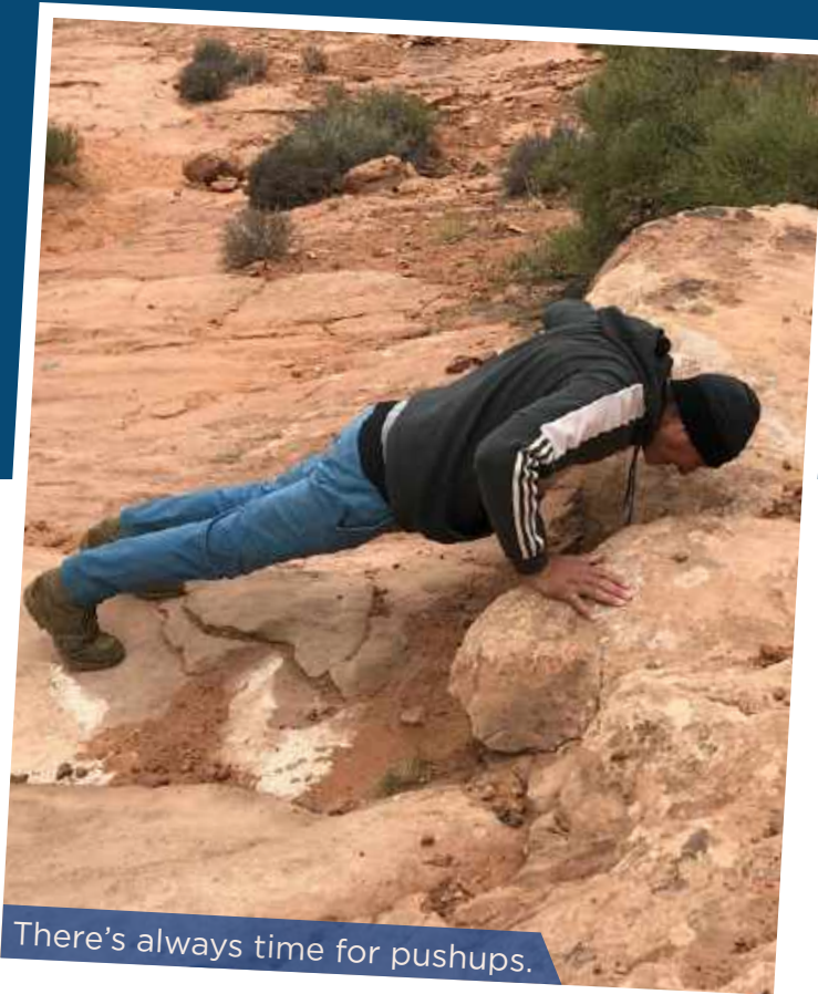
There's always time for pushups.