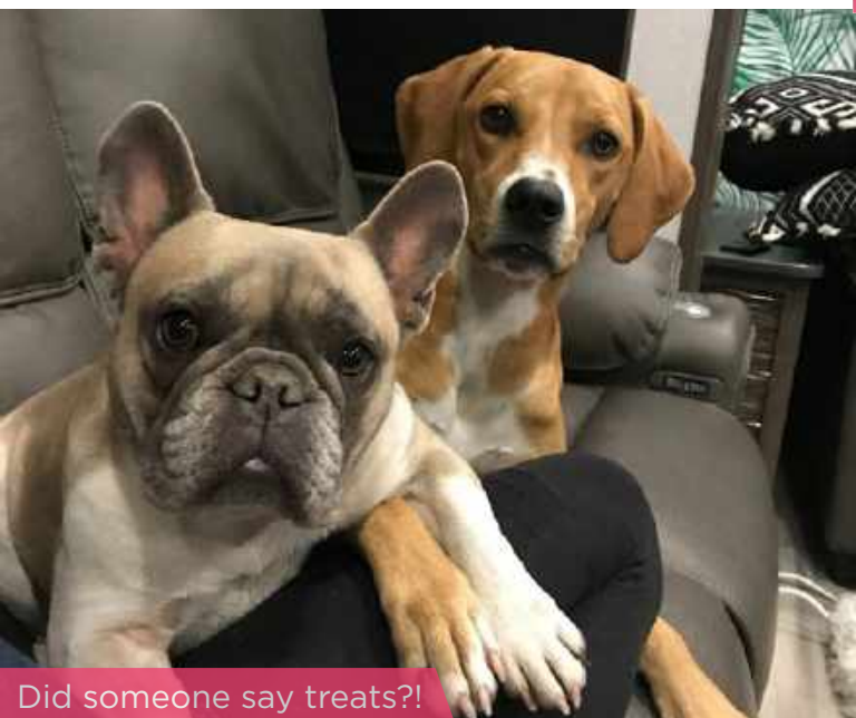
Did someone say treats?!

Not too long ago, we were talking with our neighbor, who is an avid gardener, about what to do with a particular eye sore across the pond in our backyard. No sooner did we mention it and she had a plan put together to tear up a section of the lawn and put in a new flower bed. She and husband ran home to get shovels and rakes. They proceeded to help us all day to complete the project. It was so much fun to get it done and also spend time with them.