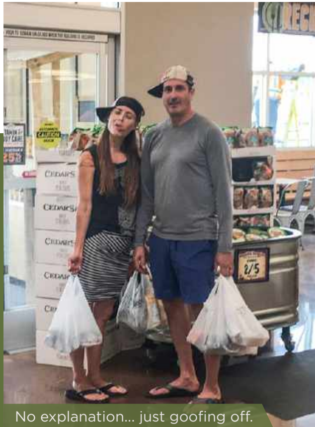
No explanation... just goofing off.

Everyone is always there to lend a helping hand or have a friendly conversation on a whim.