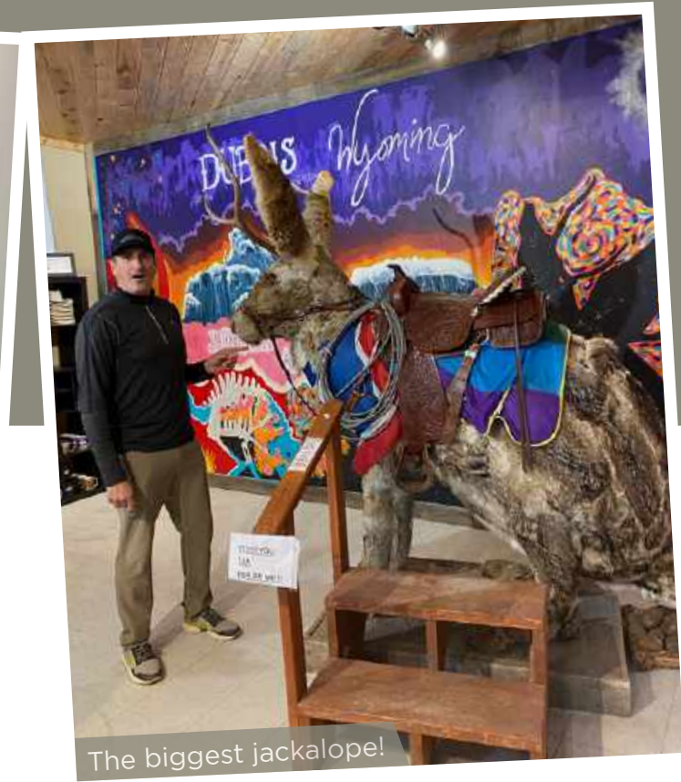
The biggest jackalope!

We have two simple rules; love and respect yourself, and love and respect others as you would love and respect yourself. This is the life we would like to share with a child.