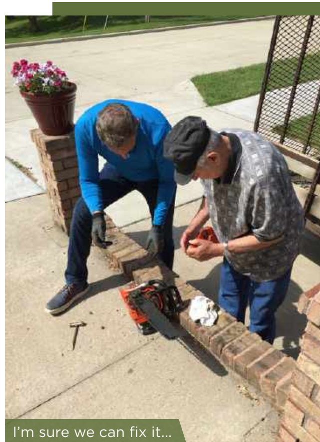
I'm sure we can fix it...

One of our favorite things to do is walk or bike to the downtown area and just see who's out and about while sipping a smoothie. Well, recently, while we were on one of those smoothie sipping adventures, we ran into our neighbor who was helping someone load carpet to donate to a charity for reuse. She shouldn't have been lifting these large carpet pieces, so we stopped to help her. It made us feel good to help and she was thankful we were there to lend a hand. We're excited to show a child how kind the world can be through our friendly community.