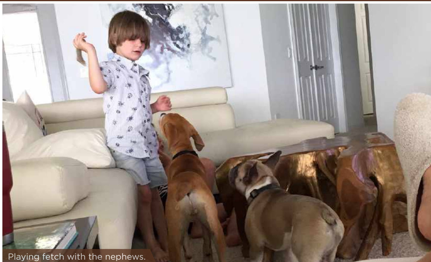
Playing fetch with the nephews.