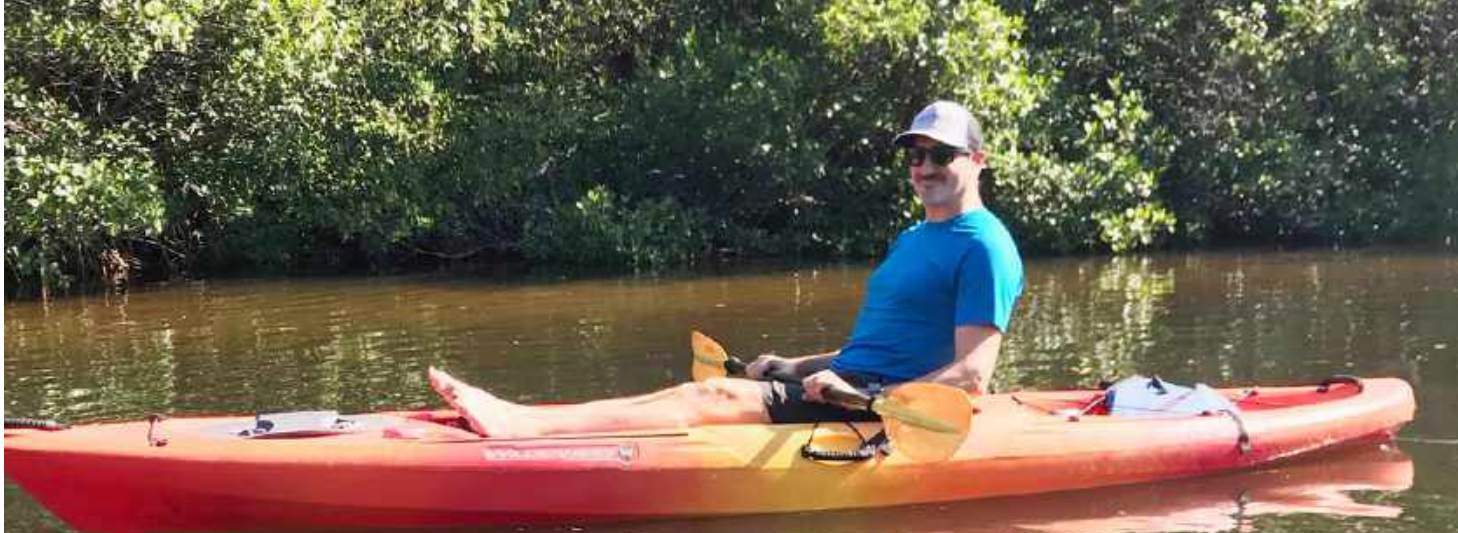
Kayaking or sunbathing?

I'm the third child in a family of four. I had, what I consider, a fairly typical childhood. I grew up in the country and worked on farms milking cows and bailing hay. I think this gave me a good work ethic and I consider myself a hard worker to this day.