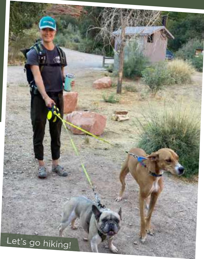
Let's go hiking!

Really, I'm a simple person who likes simple things. I don't place a lot of importance on possessions, but rather, I like to focus on the experience of living. I love to focus on the time I spend with others and how I can be of service to them, as well as what they can teach me along the way. This is what I think is most exciting about raising a child, showing them that they matter and can make a difference.