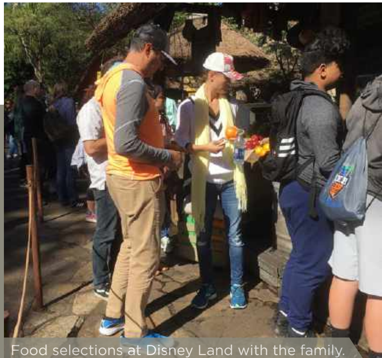
Food selections at Disney Land with the family.