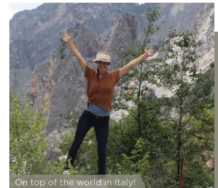
On top of the world in Italy!

Whether it's across the country in our travel trailer or via airplane overseas, we love to experience different places. Enjoying the people and food is always one of our favorite things about traveling. We are so excited to travel with a child and show them the world. The lessons and personal growth they can have seeing the world will be a joy for us to share with them.