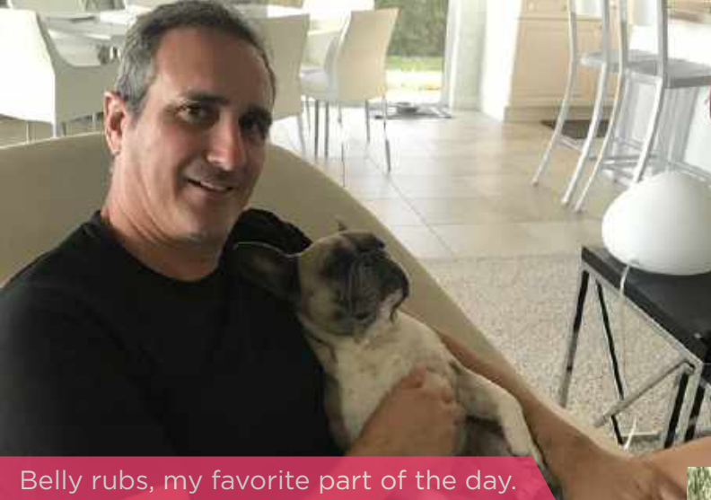
Belly rubs, my favorite part of the day.