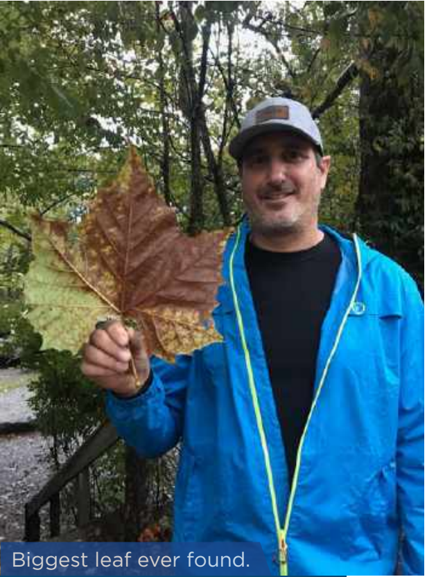
Biggest leaf ever found.