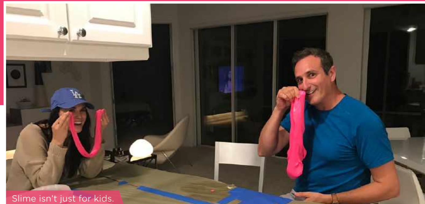
Slime isn't just for kids.

We also have land in the country that we use for composting and growing food. We have lots of space there to explore. Our two dogs, Rocky and Honey, love going there to run while we work on a project or maintain the gardens. We grow several varieties of fruit trees and are excited to add more in the future. It will be a great place for a child to have the freedom of playing in the country and the joy of exercising their imagination.