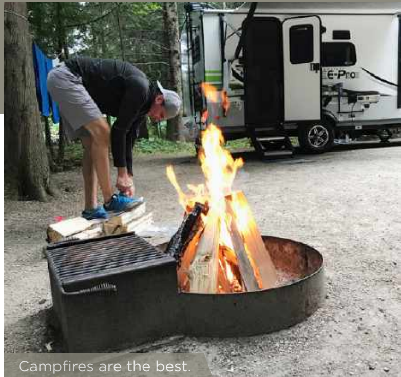
Campfires are the best.

Combined, we have twelve siblings. It's great because that means we have lots of support with raising a child and also lots of cousins for a child to be best friends with. Our families are also multicultural and interracial; Black, Caucasian, Indigenous Tribe and Hispanic are all one big happy family. We're excited to share and teach a child about their personal story and heritage, whatever it may be.