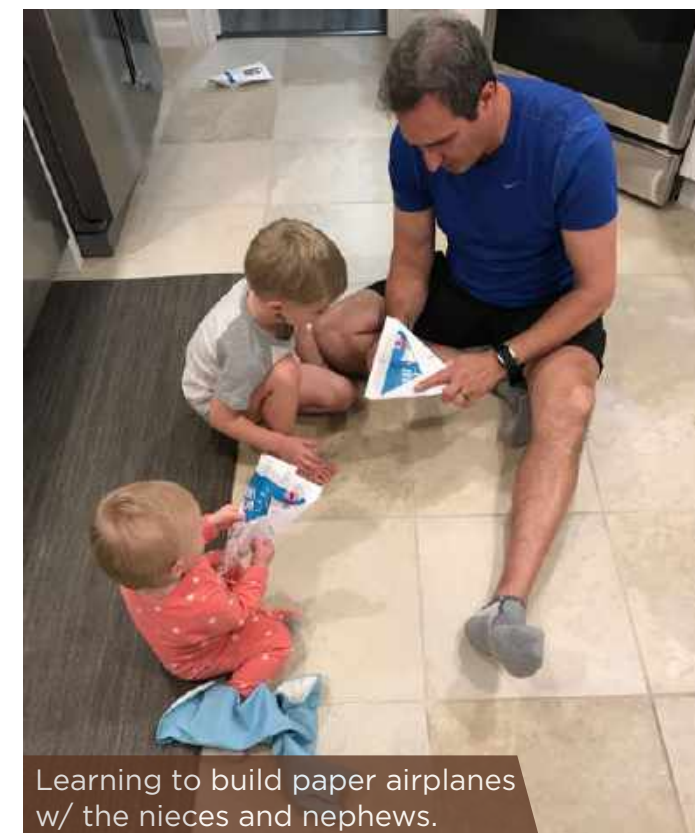
Learning to build paper airplanes w/ the nieces and nephews.