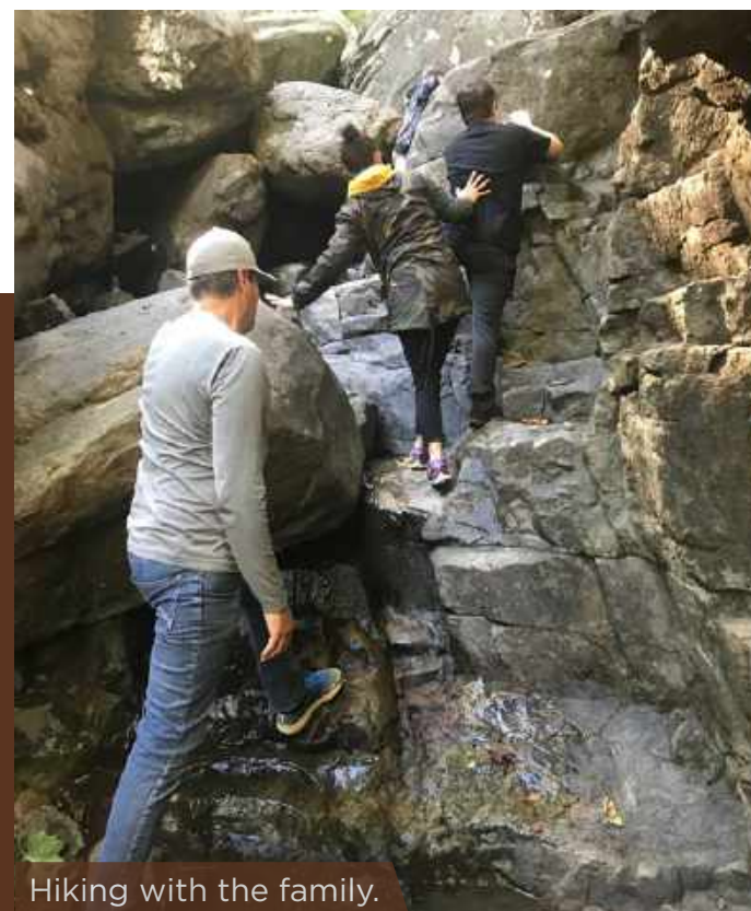
Hiking with the family.