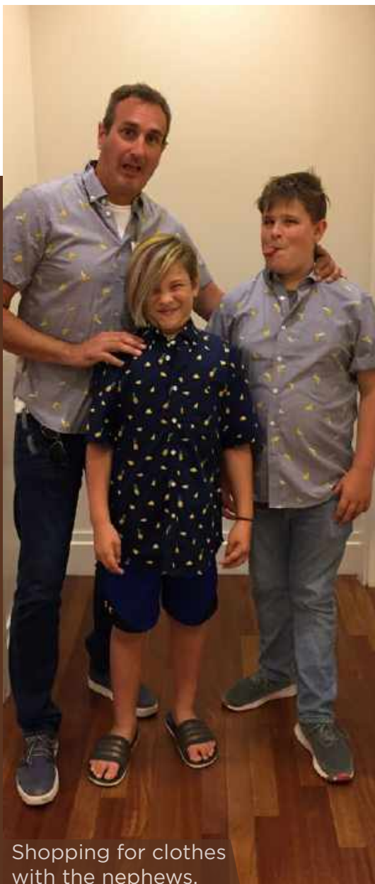
Shopping for clothes with the nephews.