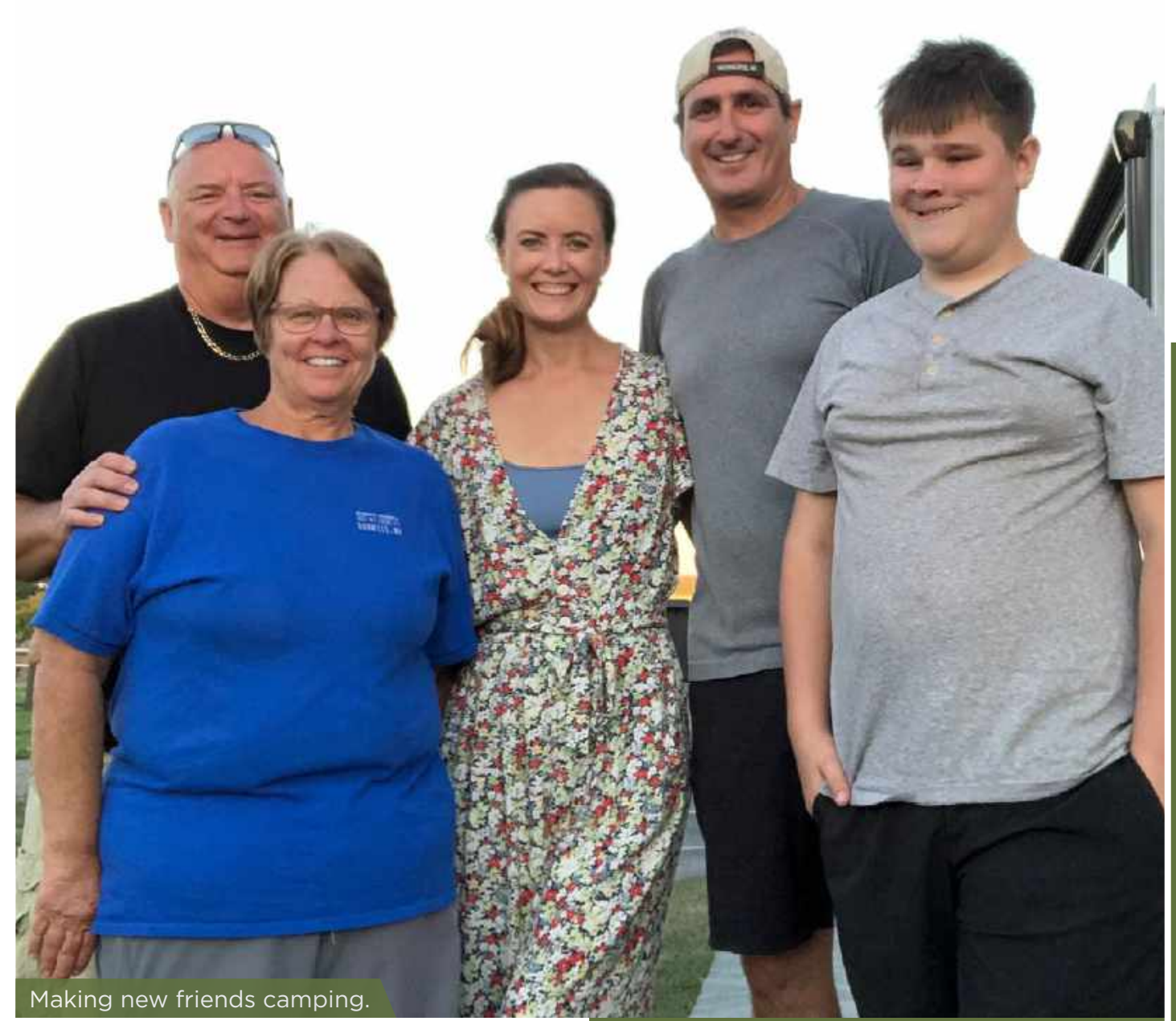
Making new friends camping.

One of our favorite things to do is walk or bike to the downtown area and just see who's out and about while sipping a smoothie. Well, recently, while we were on one of those smoothie sipping adventures, we ran into our neighbor who was helping someone load carpet to donate to a charity for reuse. She shouldn't have been lifting these large carpet pieces, so we stopped to help her. It made us feel good to help and she was thankful we were there to lend a hand. We're excited to show a child how kind the world can be through our friendly community.