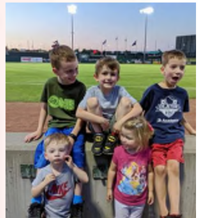
Friends at a baseball game