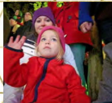
Silver Dollar City