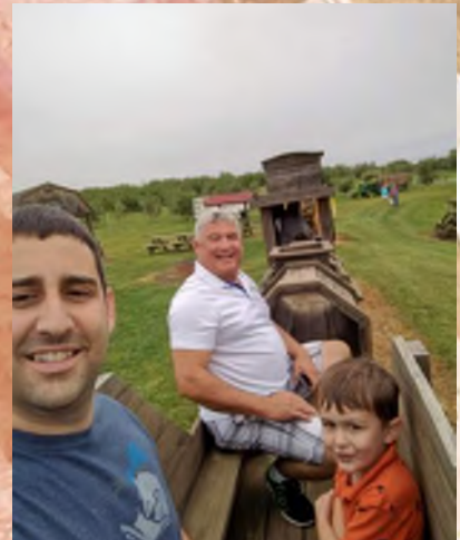
We also have made fall traditions of going to the apple orchard and sunflower farm to see the flowers.