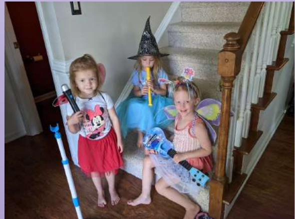
Having a concert with friends!