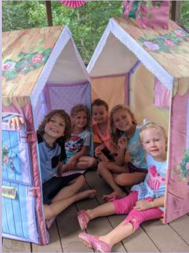
Hanging with some neighbors