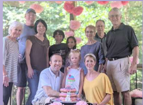
Birthdays are always fun!!!