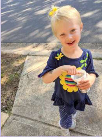
Ice cream treats from the truck that drives through our neighborhood always get the best smiles!