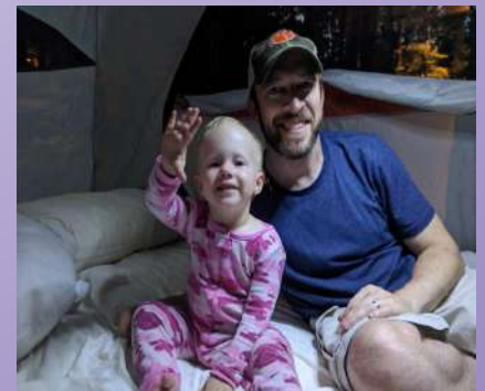
Family Camping Trip

I am so very thankful for my family and everything we have. I try to live my life in a way that shows my thankfulness . I would love for my daughter to have a sibling and would love to start the parenting journey again with another child.