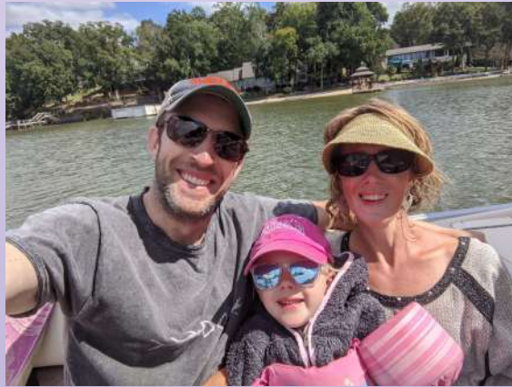
Boat ride on the lake