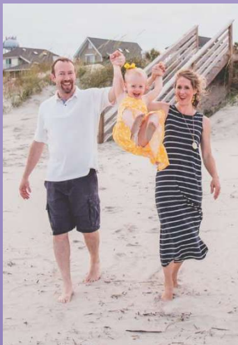
We love the beach!!!