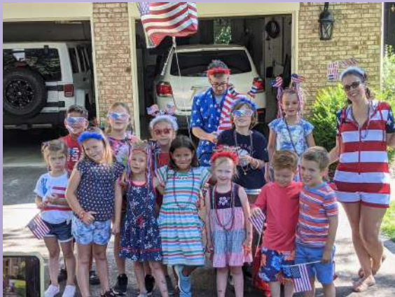
Neighborhood crew on the 4th