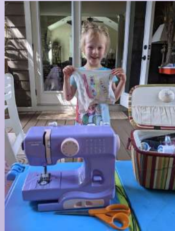
First sewing masterpiece