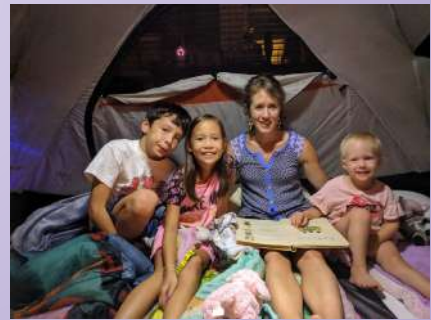
Backyard Campout with Cousins