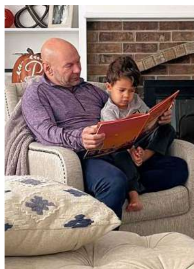
Making memories with grandparents