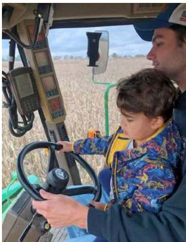
Fun on the farm