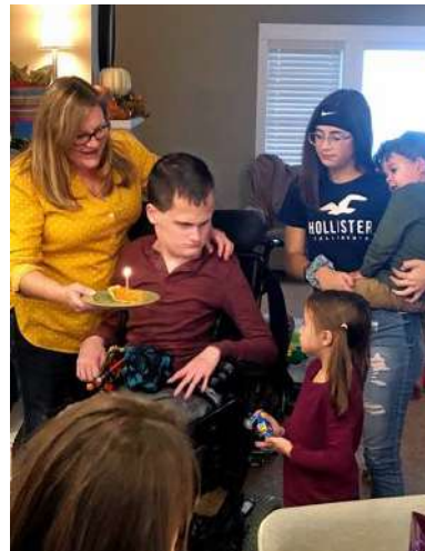
Celebrating birthdays together