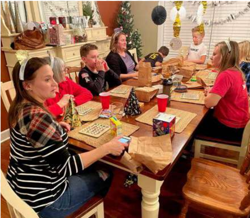
Bingo players are ready for Christmas bingo!