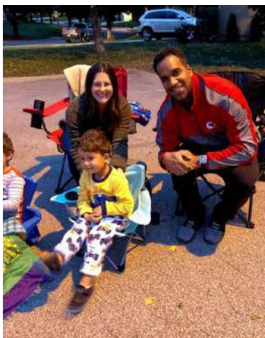
Ready for outdoor movie night at the pool parking lot