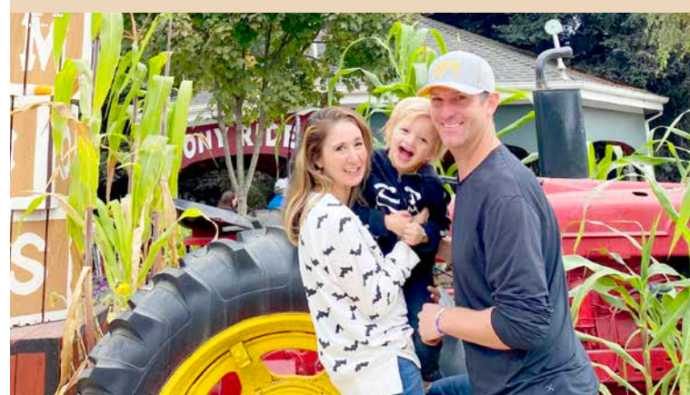
Family fun at our local pumpkin patch

While we have not met, we know the decision you are making takes remarkable strength and bravery and are so grateful to you for considering us as adoptive parents to your baby. We truly believe in building our family through adoption and are committed to this journey. We have so much love in our hearts and are excited to grow our family.