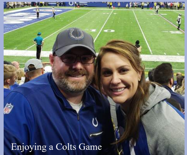
Enjoying a Colts Game

On the weekends we will often spend time with friends or family. We often relax by enjoying dinner at a restaurant in town, golfing, having a cookout, hosting game nights, etc. In the fall and winter, Sundays are usually spent watching football and cheering for the Indianapolis Colts. We are a family of Colts fans and try to travel to Indy each year to enjoy a game at the stadium. As a couple, we are lucky that we have found several hobbies like this to enjoy together.