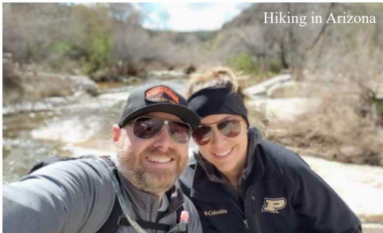
Hiking in Arizona