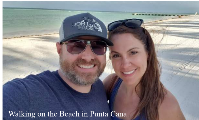
Walking on the Beach in Punta Cana