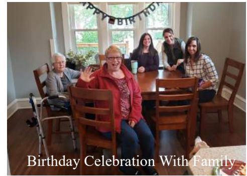
Birthday Celebration With Family

In addition to the love and support from our families, we are lucky to have close friends that have become like a family to us. In our free time we often get together with our friends for game nights, cookouts, football games, and other fun events. It has been a blessing to have such amazing friends to enjoy life with.