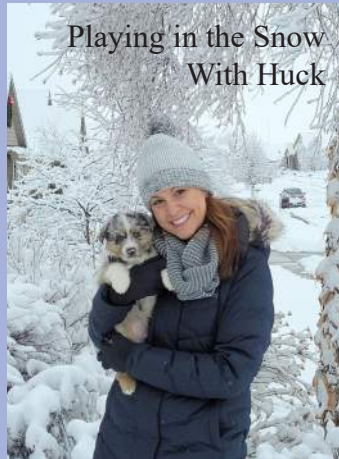
Playing in the Snow With Huck