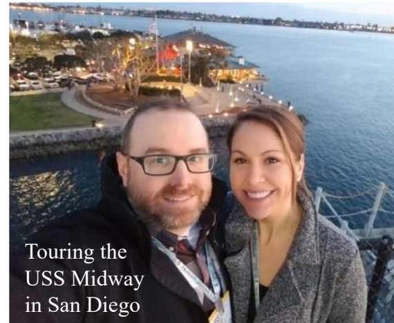
Touring the USS Midway in San Diego