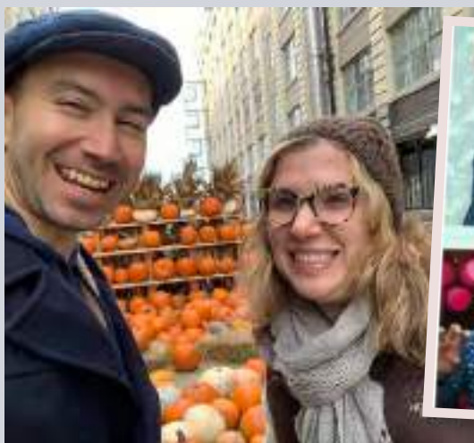
Enjoying the beginning of fall (our favorite season) in Brooklyn's Industry City