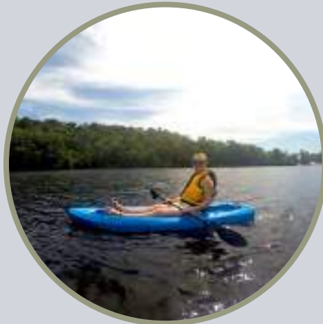
CEDAR LAKE, CT