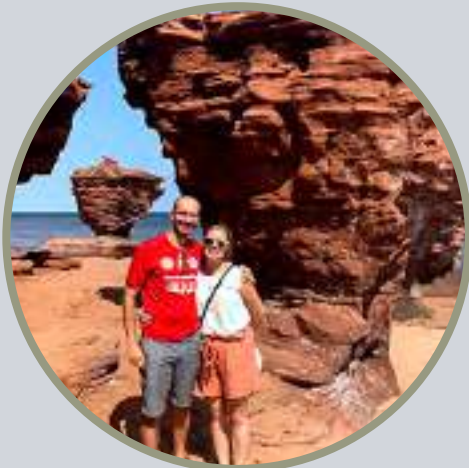
THUNDER COVE, PEI