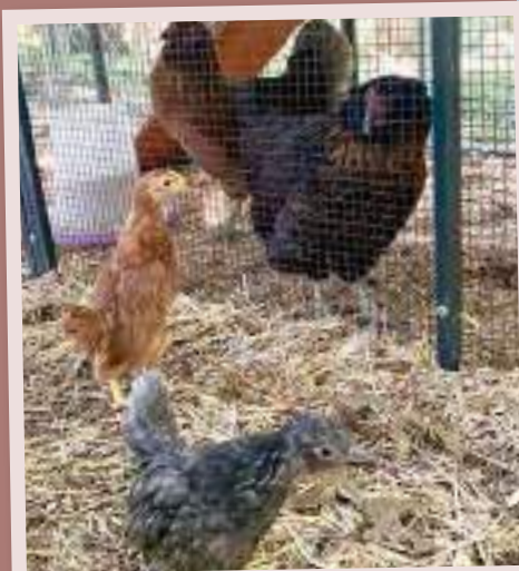
Our four chickens are of varying ages! The two oldest are Dolly and Aunt T (named after our Aunt Terri), and the babies are Madge and Blue.

Holly is our house cat, going strong at 13 years old! She mostly hides in José's closet, but when she does emerge, she's always warm and playful.