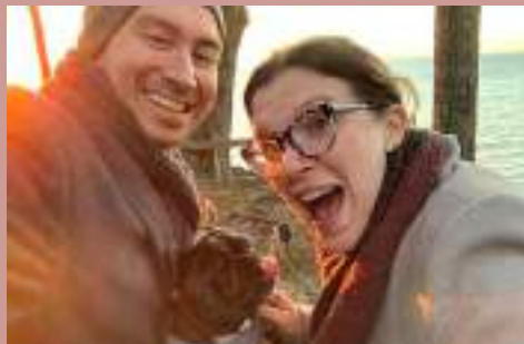
We always have a nice lookout from the sunset deck.