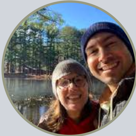
CHATFIELD HOLLOW, CT