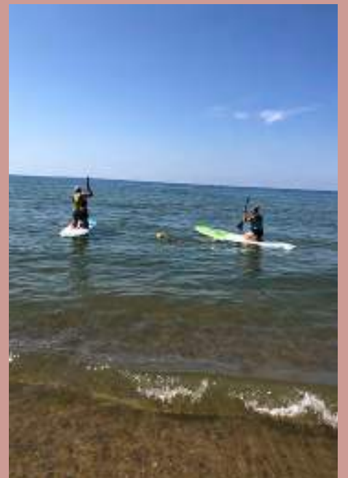
Paddleboarding on the lake.