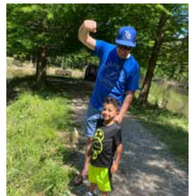
Fishing pond in the neighborhood