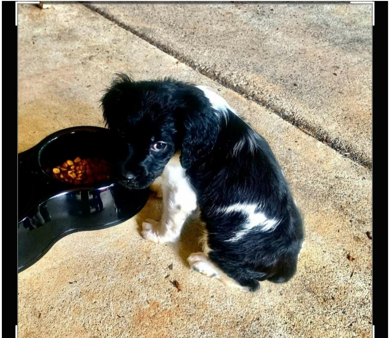
Meet Scout who is now 6 Months Old.