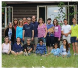
Spending time with the family at the lake house is something we look forward to each summer