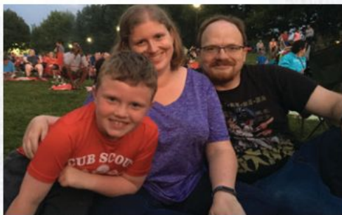
Waiting for fireworks to start with our nephew