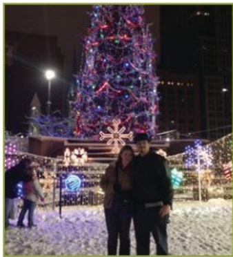
Christmas in Pittsburgh

We love to travel and explore. We have visited many places across the United States, and we look forward to continuing to explore with our children to show them the variety of life and culture within the United States and the world.