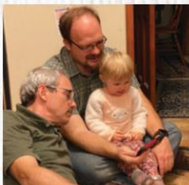
Hanging out with Papa (Mike's Dad)