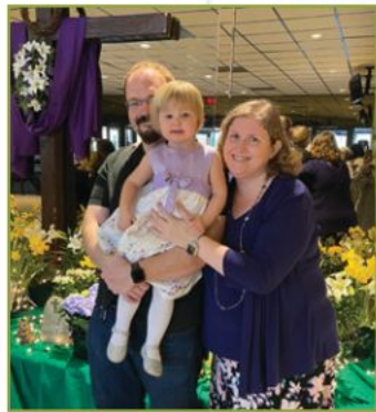
At church on Easter