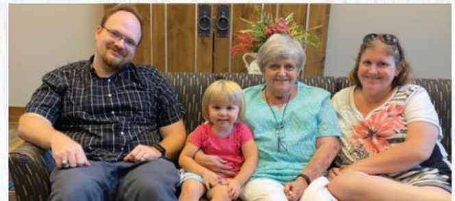
Visiting Emily's mom