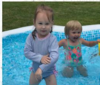
Playing in the water with a cousin