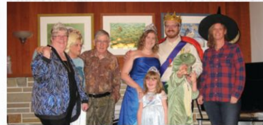
A fairy tale birthday party held for our niece, complete with Prince Charming, Snow White, the huntsman, and a dragon