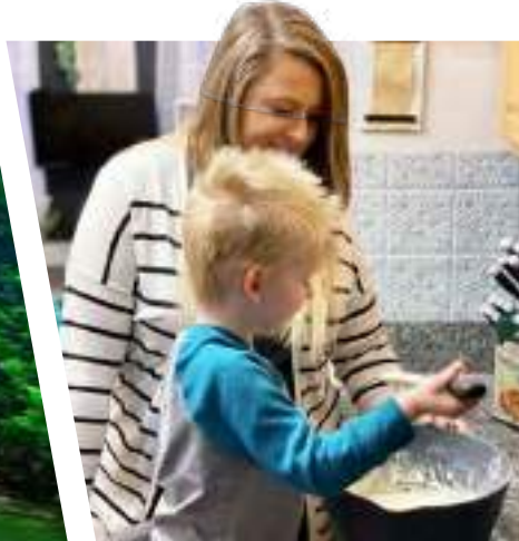
Cooking is a family activity!