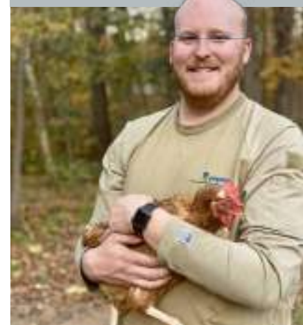
We have chickens, too!