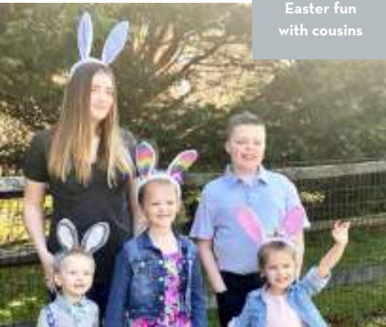
Easter fun with cousins