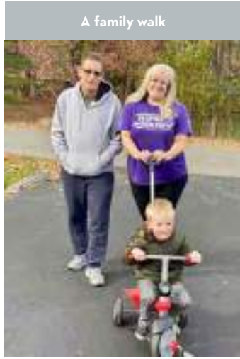
A family walk