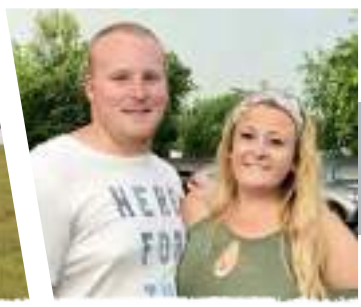
Just the two of us