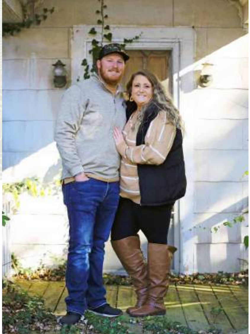
We love Disney!