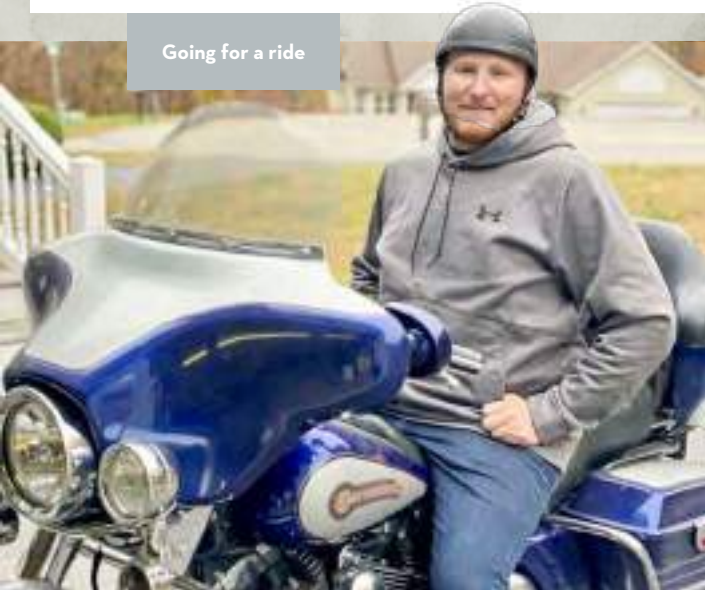
Going for a ride