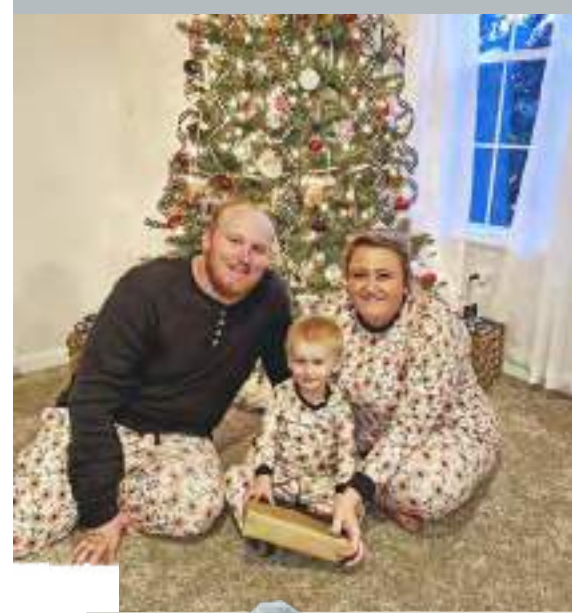
'Tis the season to be jolly

It has always been our dream to have 2 children as we both grew up with siblings in the house. There's just something about the comfort of always having a forever friend at home to grow with and we would love our children to get to experience that joy as we did. We are open to having an adoption as open or closed as you would like, and promise to fulfill and respect your wishes for you and your child. We appreciate you for taking the time to get to know a little bit about us through this glimpse of our lives.