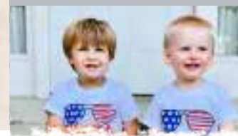
Cousins and BFFs!

Growing up, we both had dogs in our childhood homes. When we moved into our own place in 2015, we felt like something was missing—a dog! So, we adopted a Yellow Lab; Ryder. A year later we adopted a Chocolate Lab; Nova. Once we moved into our forever home where we had a much bigger yard, we decided to take on a coop and 6 chickens!