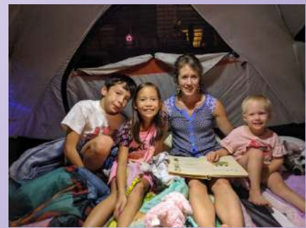
Backyard Campout with Cousins