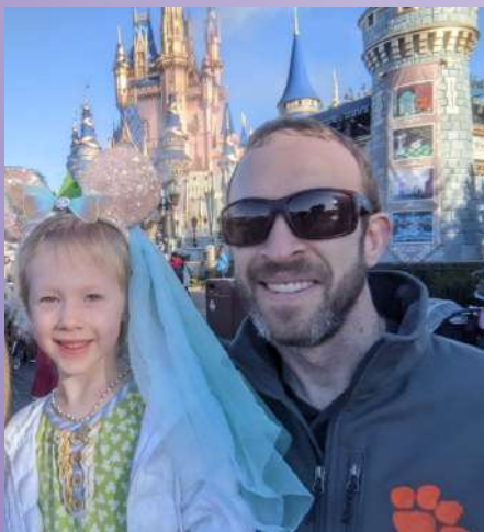
Recent Family Trip to Disney

I am so very thankful for my family and everything we have. I try to live my life in a way that shows my thankfulness . I would love for my daughter to have a sibling and would love to start the parenting journey again with another child.