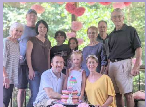
Birthdays are always fun!!!