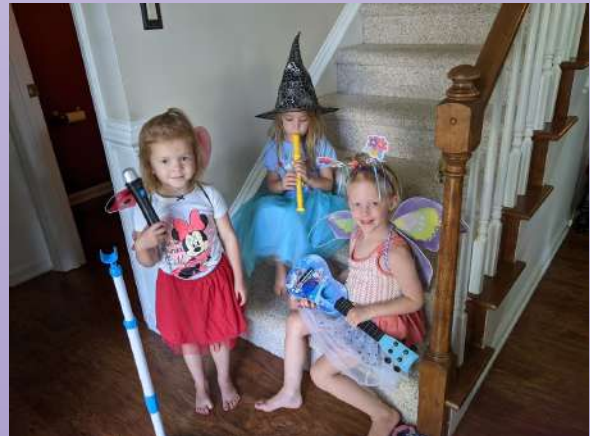
Having a concert with friends!