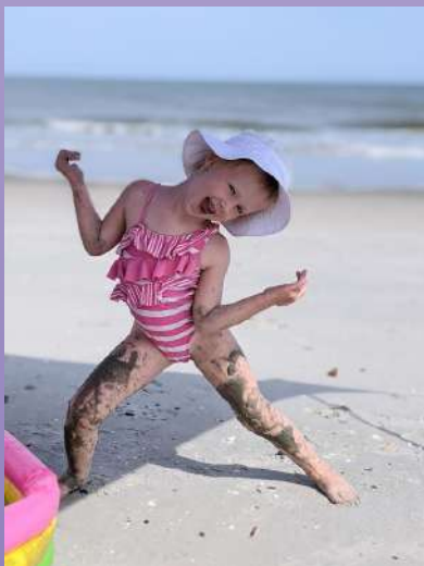
We love the beach!!!