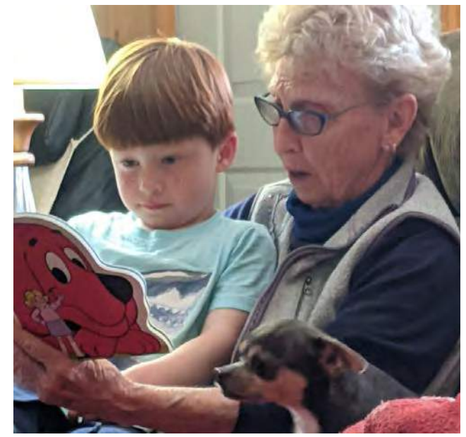
Reading with Great Grandma