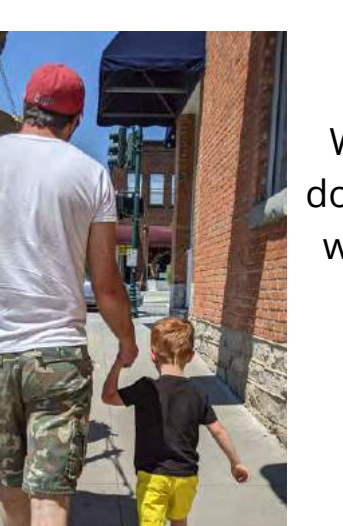
Walking downtown with dad