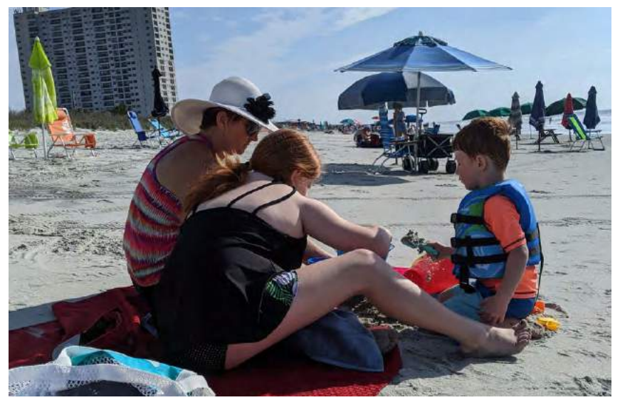
Playing with Nana and our cousins on the beach