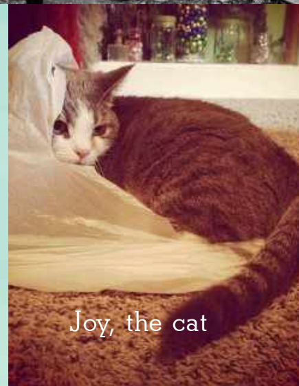
Joy, the cat