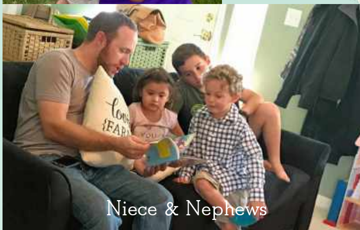
Niece & Nephews