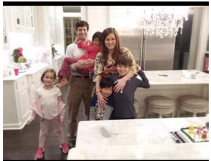
A little birthday celebration at home

In our family we love to have fun. It is our intentions as parents to give our kids the stability that they need to grow into who God wants them to be and part of that is making life fun. We love to spend time together as a family. We enjoy traveling and have been all over the United states on vacations and travels. We love to stay active and enjoy the outdoors. We love to do things together and are always trying to think of new things that we can all enjoy together as a family! All of our children are involved in activities at our church. Our oldest son who is 13 is active in our youth group and volunteers his time to help in the children's ministry department. Our daughters who are both 10 are both in the children's choir and one of our daughters enjoys being involved in bible drill. Our youngest son who is 8 loves to sing with the children's choir as well and is active in his Sunday school class.