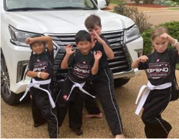
The kids getting ready for karate