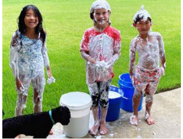
Having fun outside with Lilly our dog