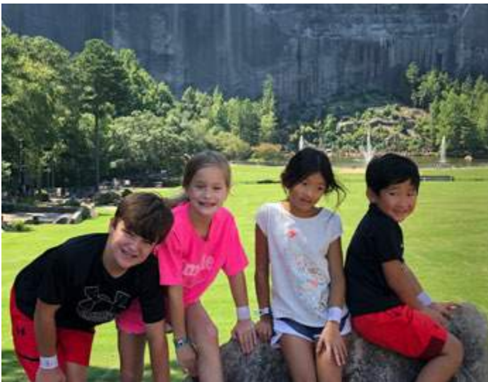
Some vacation fun