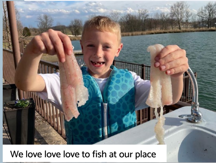
We love love love to fish at our place

Our home is located just outside of the city on 20 acres of land with a beautiful pond and woods to play in. We spend a lot of time outside and have playhouses, swing sets, trails in the woods, and a trampoline. In the summer, we love to swim and go fishing in the lake.