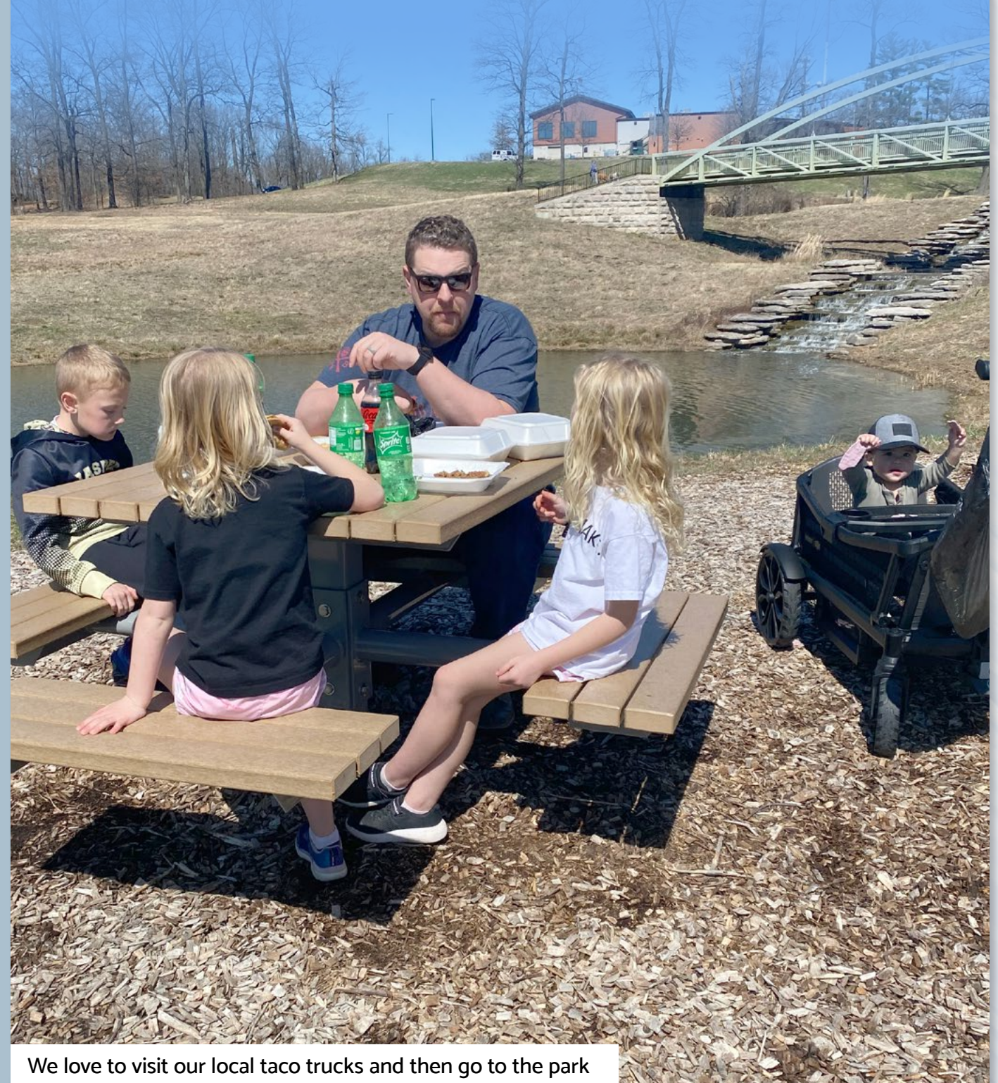
We love to visit our local taco trucks and then go to the park

As a family, we love to enjoy the outdoors and all the fun activities that go along with being in nature. A few of our favorite outdoor activities include biking, hiking and kayaking. We also enjoy arts and crafts, making things for folks, and spending time with our friends. We look forward to sharing these passions and exploring whatever passions this child has!