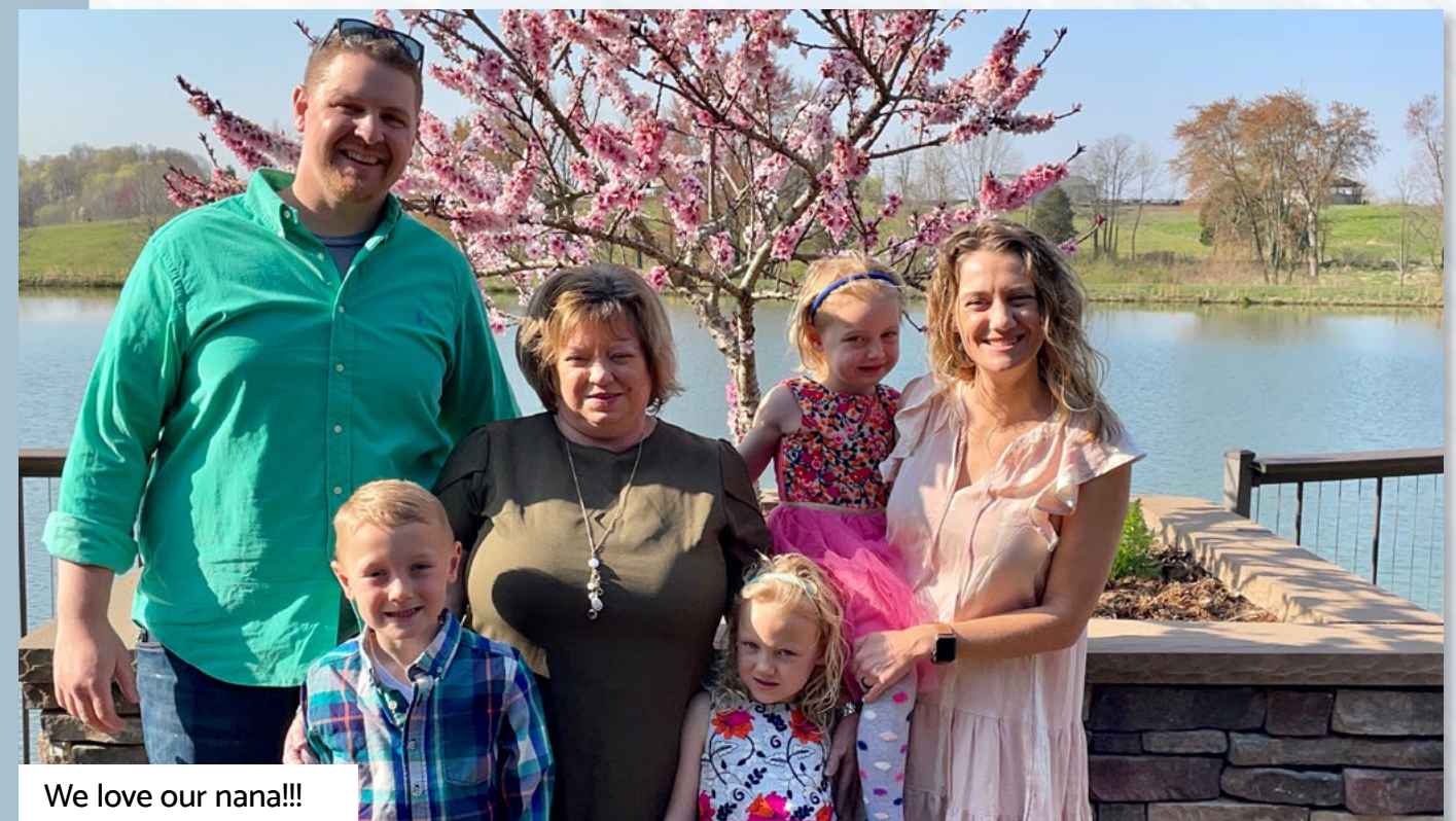
We love our nana!!!

Holidays are always a blast when we get our huge group together to enjoy food, gifts, and surround everyone with love. Our entire family is excited to welcome another beautiful child into our hearts and homes!