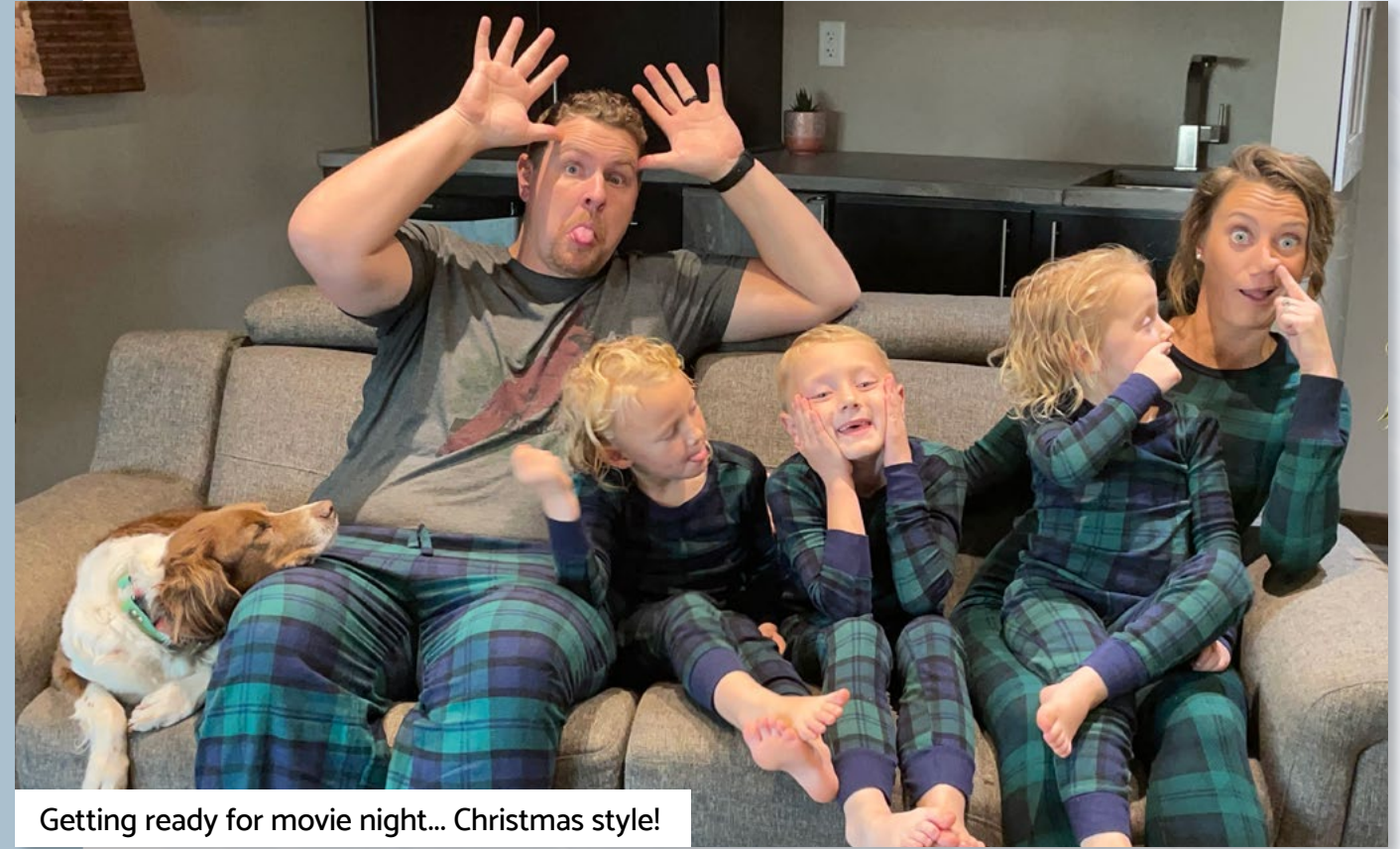
Getting ready for movie night... Christmas style!

Our city was rated as one of the top places to live and raise a family in the United States and our kids attend five-star public schools. Even living outside of the city, we are still able to be downtown in less than 10 minutes!