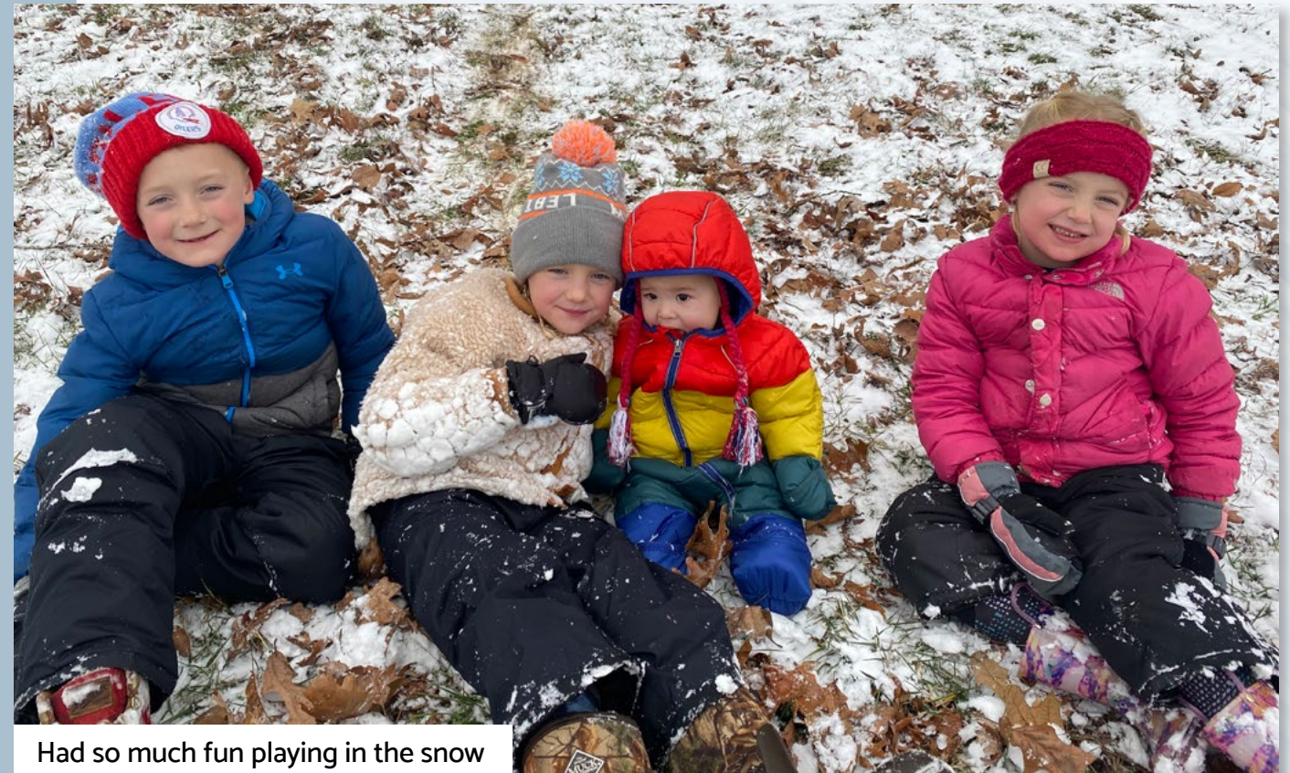
Had so much fun playing in the snow