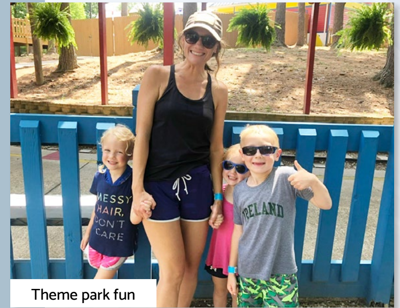
Theme park fun