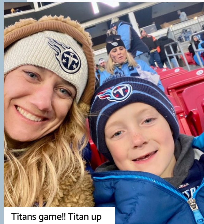
Titans game!! Titan up

As a family, we love to enjoy the outdoors and all the fun activities that go along with being in nature. A few of our favorite outdoor activities include biking, hiking and kayaking. We also enjoy arts and crafts, making things for folks, and spending time with our friends. We look forward to sharing these passions and exploring whatever passions this child has!