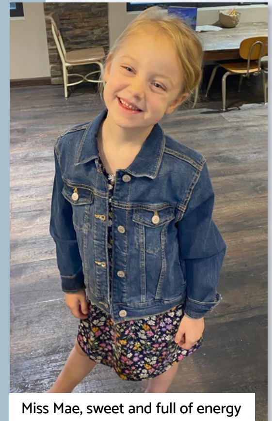
Miss Mae, sweet and full of energy