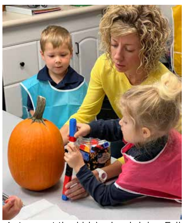
Autumn at the kids' school doing Fall activities in each of their classes. She enjoys being involved in their education.