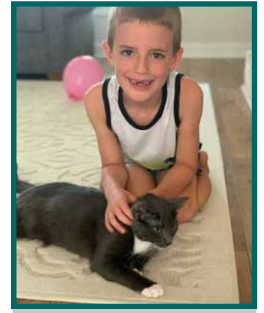
Our cat, Sketch