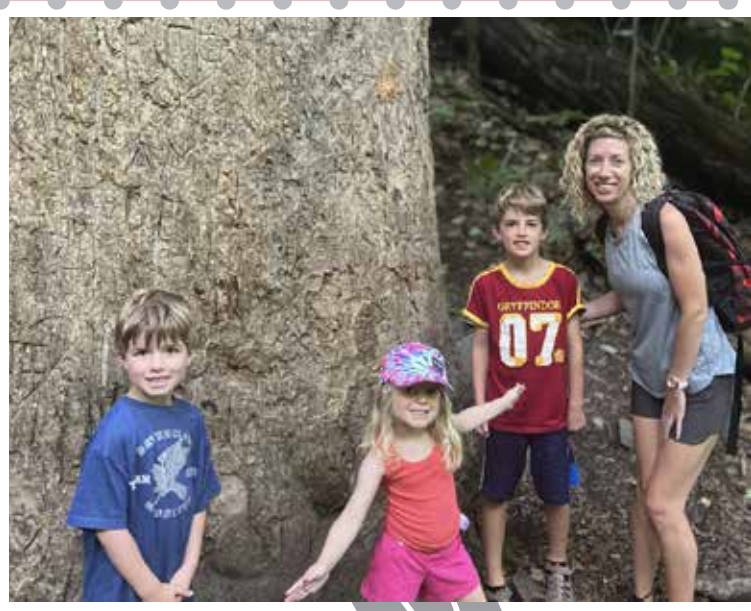
Family hike on a trail close to our home