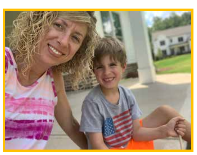
Going on one-on-one dates