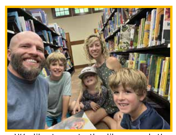
We like to go to the library...a lot!