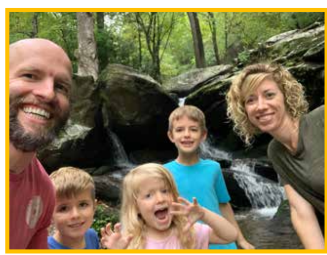
We enjoy being outside.