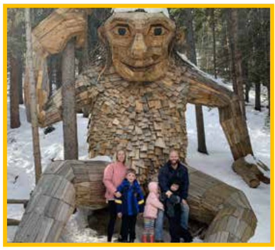
Traveling-This is a ski trip to Colorado.