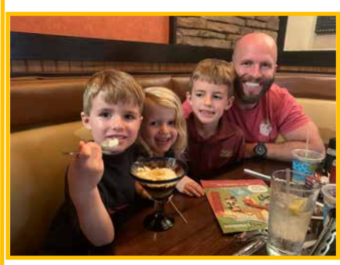
Eat sweet treats every now and then