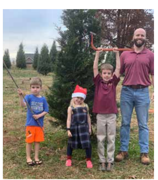
Searching for our Christmas tree