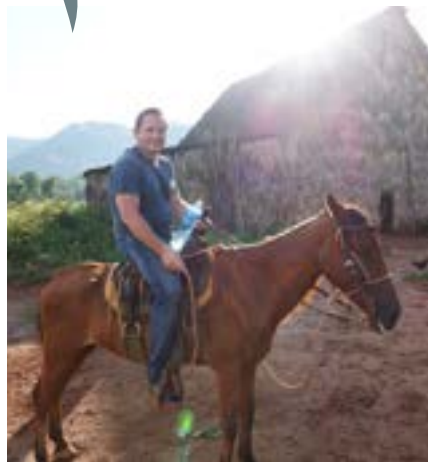
Horseback Riding in Cuba