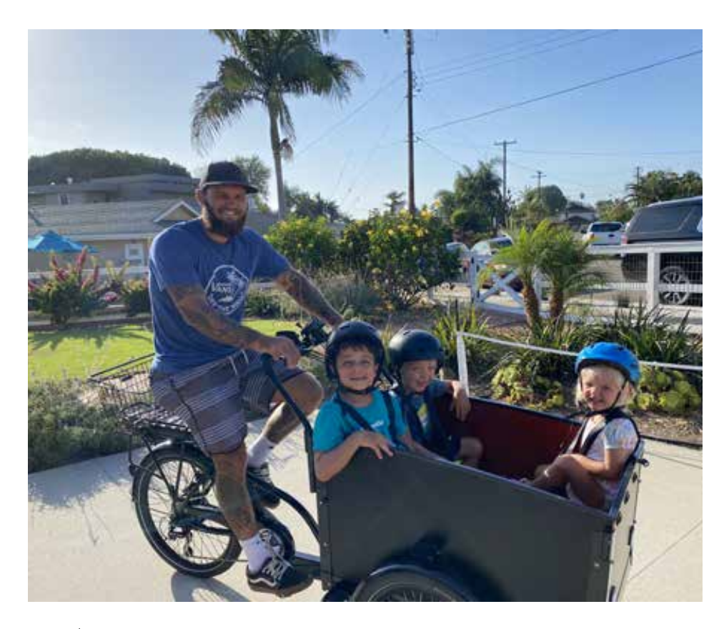
Home and family adventures