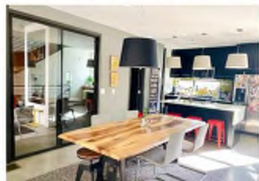
This is our townhouse

Our home is bright and airy, has three bedrooms and plenty of room for a child to grow, play and have their own space. We have three patios including a roof deck, to be able to spend time outside together.