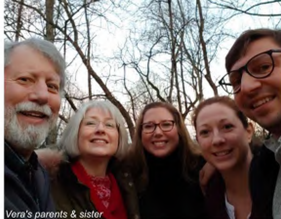
Vera's parents & sister