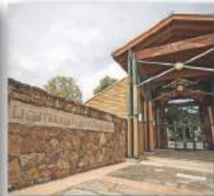
Lichterman Nature Center (1 mi.)