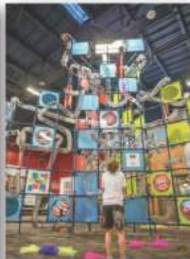
The Children's Museum (5 mi.)